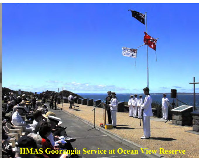
HMAS Goorangai Service at Ocean View Reserve