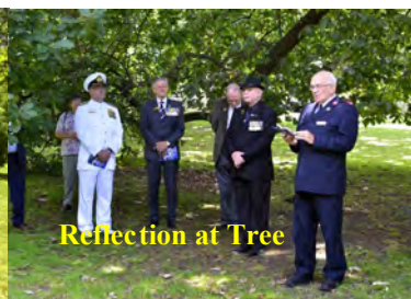
Reflection at Tree