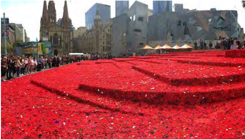
A 120 poppy project turned into a worldwide phenomenon of over 250,000 knitted poppies from around the world. The sea of poppies blankets Federation Square.

their Regiment's involvement in the war and as a result, I am a much better informed and respectful of their lives at war. And having been ever so slightly infected by the genealogical bug, I'm now researching my Great Grandfather's role as a Colour Sergeant in the East Yorkshire Regiment and as a Special Constable in the pre-WW1 period. I'm sure that I'm not the only one who has reconnected with their family's past as a consequence of the coverage in the media during the past twelve months. Despite the apparent boredom of some, I think that in of itself is a wonderful outcome for Australia.