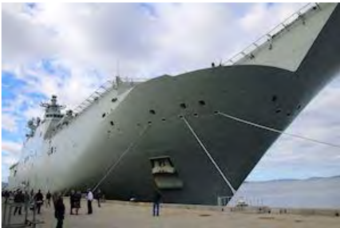
HMAS Canberra alongside in Hobart for Anzac Day 2015. There are some great photos of her in our Gallery page on the website.

HMAS Anzac & Tobruk Association 15 - 19 June 2015 HMAS Leeuwin 3rd Intake [1961] 10 - 12 July 2015 HMAS Perth II Anniversary Cruise 16 - 20 July 2015 HMAS Bataan Veterans Association 10 - 13 September 2015 HMAS Vendetta (All Ships Crews) 11 - 14 September 2015 NAA Nation Reunion 25 - 27 September 2015 HMAS Quickmatch 60th Anniversary 13-14 September 2015 HMAS Lonsdale 9 - 10 October 2015 HMAS Leeuwin Marks Division 13th Intake 7th - 17th Oct 15 MOBI Gathering 4 November 2015 Junior Recruits Leeuwin & Cerberus 9 - 15 November 2015 Waller Division [15 January 1966](expressions of interest) January 2016 Rhoades 29th JRTE HMAS Leeuwin 12-14 February 2016 WRANS-RAN 26-28 February 2016 Naval Health Services 18 - 20 March 2016 All Navy Reunion (expressions of interest) 13 - 16 October 2016 Moran Division [28 November 1964] 18 - 20 November 2016