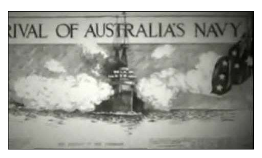
Click image to view the RAN video of the Fleet entry in 1913

Navy's signature commemorative event for 2013 is the International Fleet Review in Sydney from 3 - 11 October 2013 to celebrate the centenary of the momentous first entry of the Royal Australian Navy's Fleet into Sydney, led by the flagship HMAS Australia on 4 October 1913.