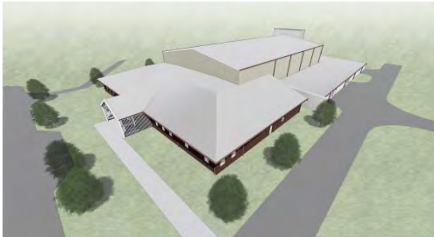
SAST - aerial from SE

from varying heights in marginal water temperatures will be a thing of the past. The demonstration pool will also be capable of delivering small boat capsizing training, which will be the first of