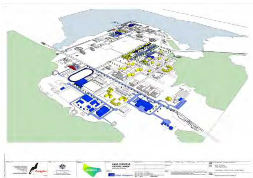
3D from the NW