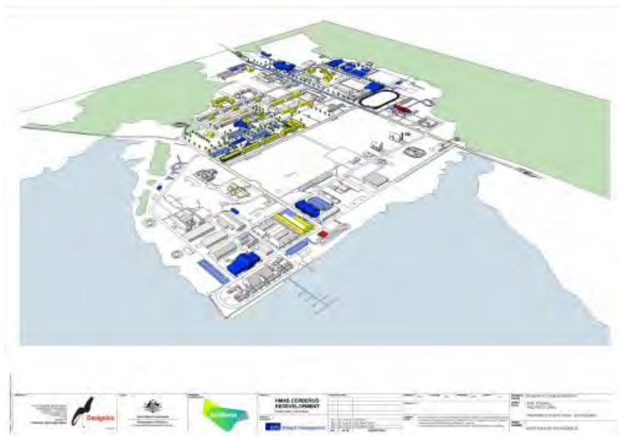
3D from the SE

Yours Aye! CO – HMAS Cerberus and the NVN Team