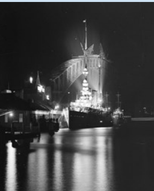
1930: A foreign warship HMLNS JAVA berthed at Circular Key, Harbour Bridge being constructed in the background

The first major display of Warships in Australia was the visit of the USA Great White Fleet in 1908