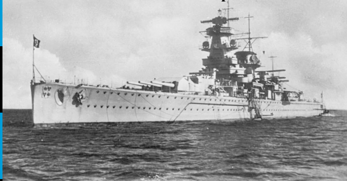
The German Pocket Battleship: Admiral Graf Spee