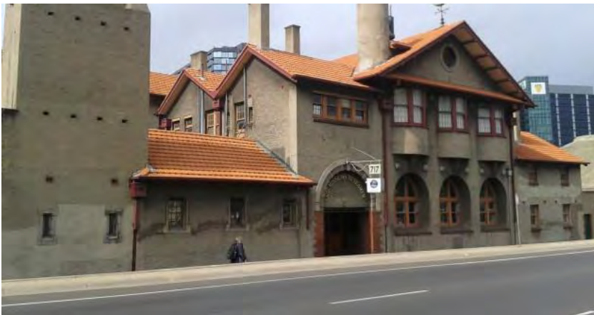
Mission to Seafarers - 717 Flinders St, Docklands

exclusive use of the building and gardens to MNC affiliated associations on Anzac Day, however, pre-booking is essential.