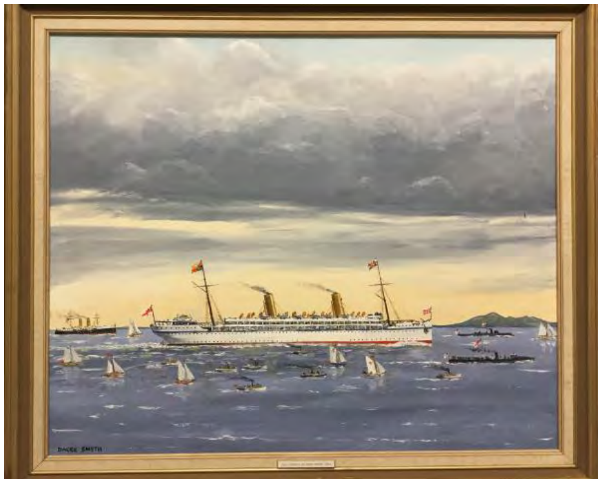
The Arrival in Melbourne of the Royal Yacht HMS Ophir - May 1901 Painted by Dacre Smyth in 1999 On display in the Museum of HMAS Cerberus

Observation Point in Port Phillip served as a Torpedo Station while naval support for these operations and facilities was provided by the torpedo boats HMVS Nepean , HMVS Lonsdale and HMVS Countess of Hopetoun .