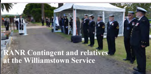
RANR Contingent and relatives at the Williamstown Service