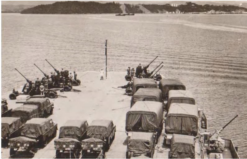
HMAS Sydney III entering Jessleton Harbour

Chauvel , had been ordered to rendezvous with HMAS Sydney in Jessleton Harbour, Sabah. Both of these Army LSM'S had encountered life threatening storms enroute to Jessleton.