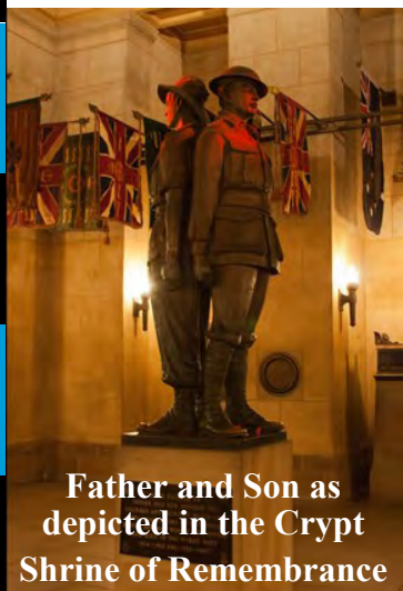
Father and Son as depicted in the Crypt Shrine of Remembrance

are able to attend services focused on their legacy at a time when Australia came under direct threat. Many forget that ship wrecks are strewn along the east coast of Australia, ships lay at the bottom of Bass Strait. There are sites where 'rusting hulks' are headstones for more than 2,000 sailors. These services to recognise our ships deployed in WW2 and are no less important than ANZAC.