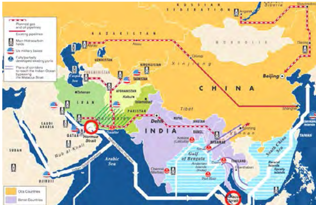
Figure 1: Chinese energy infrastructure in the Indian Ocean [20]

Friedberg explains that rising powers will often challenge their territorial boundaries and the arrangements of international institutions: 'As was true of the US in the late nineteenth and early twentieth centuries, so too is China's growing economy bringing expanding military capabilities.' Through the lens of a pessimistic realist, he concludes that the disputes occurring from the expanding interests of a rising power and those of its more established counterparts are seldom resolved peacefully. [19] To test the validity of this view, at least in terms of maritime security in the Indian Ocean, it is necessary to describe certain aspects of the relationships between China and interested Indian Ocean states.