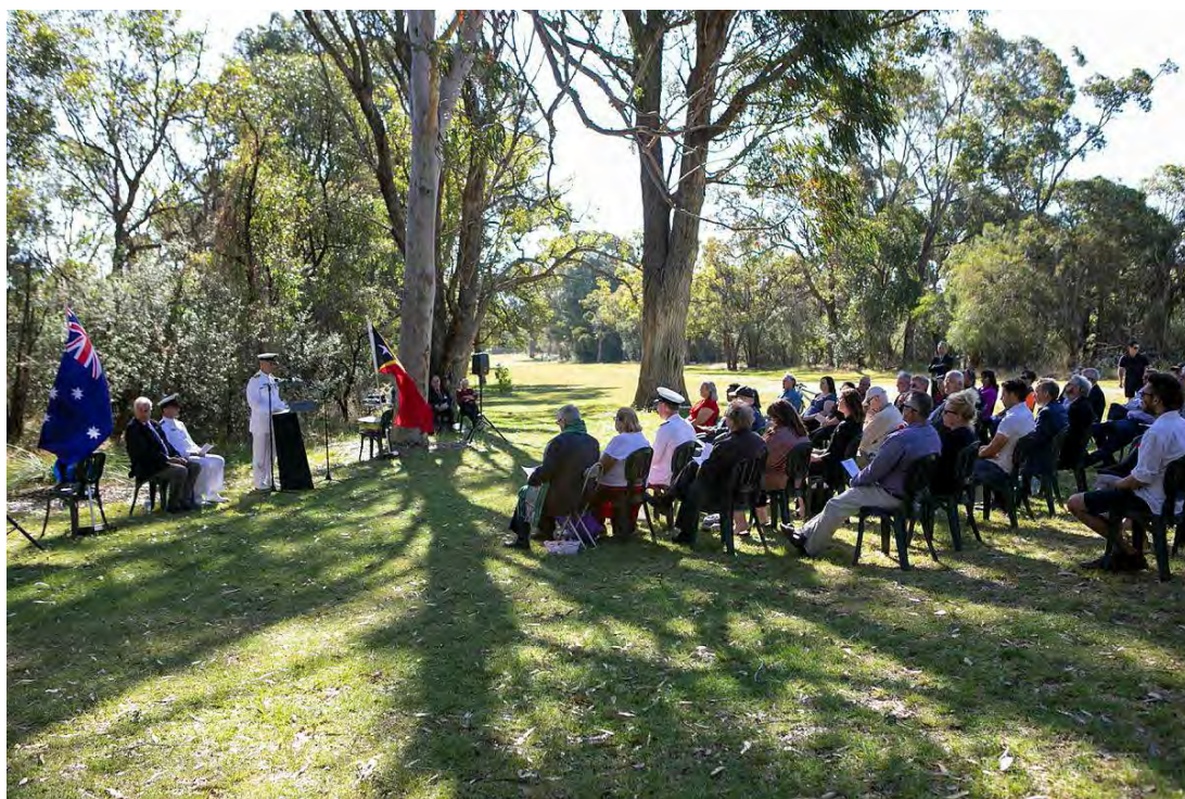
Some of the congregation at the 2020 Remembering HMAS Armidale Memorial Service