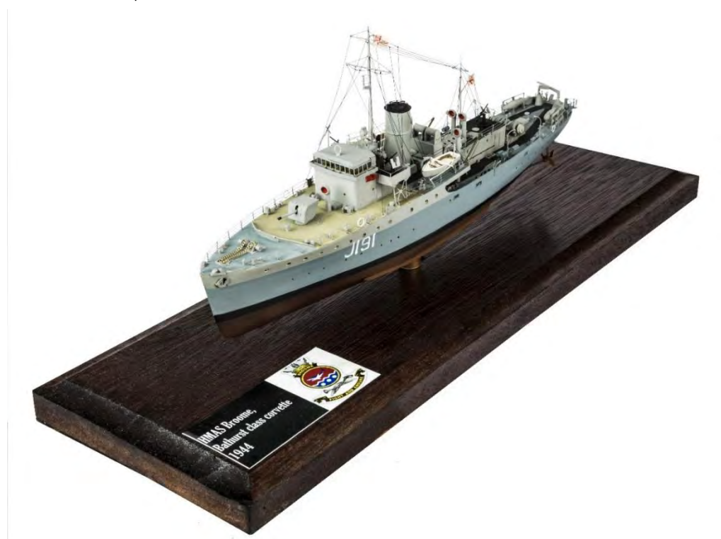
Bathurst Class Corvette HMAS Broome – sister ship to HMAS Armidale

All models displayed in the exhibition are built to a scale of 1:192. Each model is very elaborate in detail and is true to form taken from known blueprints and plans of the actual ships.