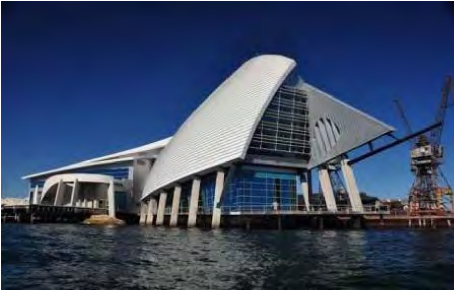
The Western Australia Maritime Museum, Fremantle