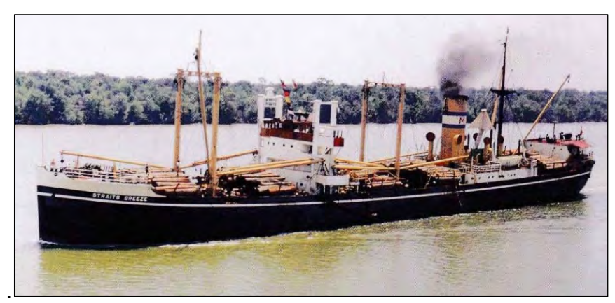
The Straits Breeze with a full load of logs in the Rajang River, Sarawak in the early sixties

When I recently received the current issue of the Nautical Association of Australia's quarterly journal. 'The Log', I was astonished to see this photo of the steamship, Straits Breeze . This ship was built, in 1938, by the Caledon Shipbuilding & Engineering Company at Dundee, as the Kooringa , for McIlwraith McEacharn Ltd.