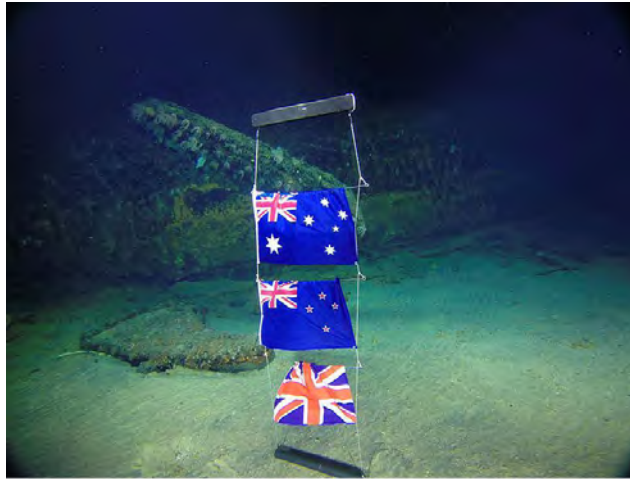
Flags commemorating the lost crew of HMAS AE1