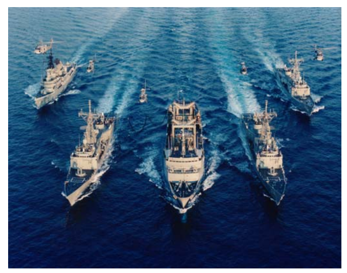
HMA Ships Brisbane, Adelaide, Success, Darwin and Sydney rendezvous for a handover in the Gulf of Oman during Operation DAMASK 1, December 1990.

Not only does 2015 mark the 50<sup>th</sup> anniversary of the Vietnam commitment but also the 25<sup>th</sup> anniversary of the RAN commitment to the Gulf War (1990-91) and the liberation of Kuwait under the auspices of Operation DAMASK 1.