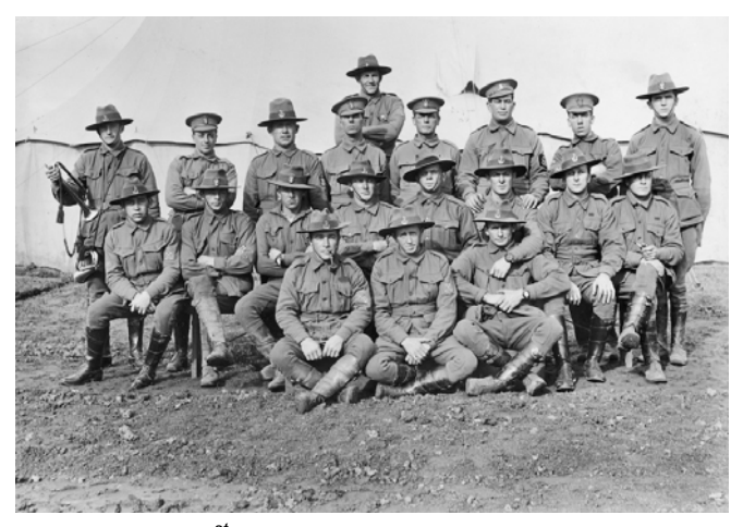
Ratings of the 1<sup>st</sup> RANBT at Domain Camp, Melbourne, 1915, prior to embarking for overseas service

Also at Gallipoli was the 1<sup>st</sup> Royal Australian Naval Bridging Train (1<sup>st</sup> RANBT), formed under the command of Lieutenant Commander LS Bracegirdle, RN, as a mobile naval engineering unit equipped to build pontoons and bridges in support of the military. The initial concept was that it would serve on the battlefields of the Western Front in much the same manner as the engineering elements of the Royal Navy Division. The term 'train', was a direct reference to the horse-drawn wagons that would, in theory, form and move 'in train' to carry the unit's heavy lumber, building supplies and equipment. Many of the ratings serving in the 1<sup>st</sup> RANBT were designated 'drivers' and again this refers to wagon drivers.