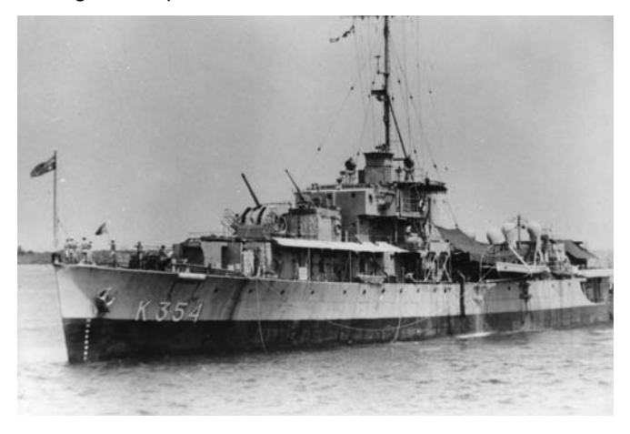
HMAS Gascoyne was one of numerous RAN ships to fight in the Pacific theatre

July 1945 also saw the River class frigate Gascoyne (I) carry out the last naval bombardments in the Balikpapan area. On 26 July, in support of a military force designated BUCKFORCE, Gascoyne proceeded up the Balikpapan River, engaging three separate Japanese held targets as well as landing a military patrol to inspect the village of Mentawir. This action proved to be Gascoyne 's last in the war against Japan.