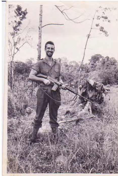
Me with SLR (claymore mine in tree stump)

Five days after returning to Vendetta , Lance Corporal Rambahadar Limbu of the Gurkha Rifles was in action at Bau. For his bravery he was awarded the Victoria Cross. During the Confrontation UK and Commonwealth forces were awarded 1 VC, 1 DSO, 1 DSC, 4 DCM, 48 MC and 45 MM.