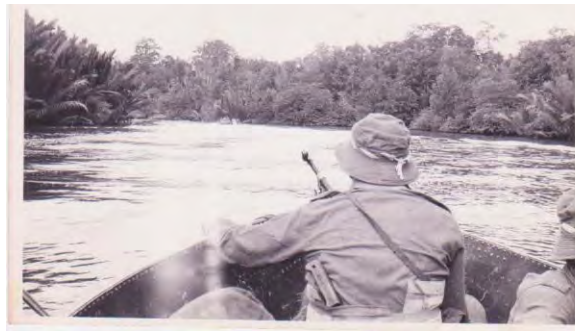
View from assault craft

landing we moved through some swamp, then to high ground, gullies and over ridges. Late in the afternoon we set up camp for the night. We were