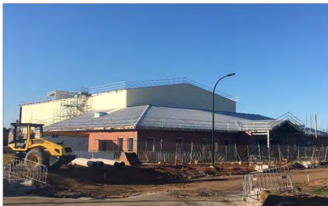
Survival at Sea Training Centre under construction

A feature building that is eagerly awaited is the provision of a new Survival at Sea Training Centre. This building will make jumping off the wharf into a chilly Hanns Inlet a distant memory. The new facility will involve abandon ship training with a safety jump to be undertaken from a height of 5m into a 25m x 15m x 5m deep training pool. The pool demonstration area will also include rain, wind and wave simulation to enhance the realism of the training experience. Additional state of the art training aids to be fitted in the coming months include a small boat capsized trainer, a helicopter wet winch recovery capability and a 10m high escape chute to replicate the abandon ship arrangement on an LHD.