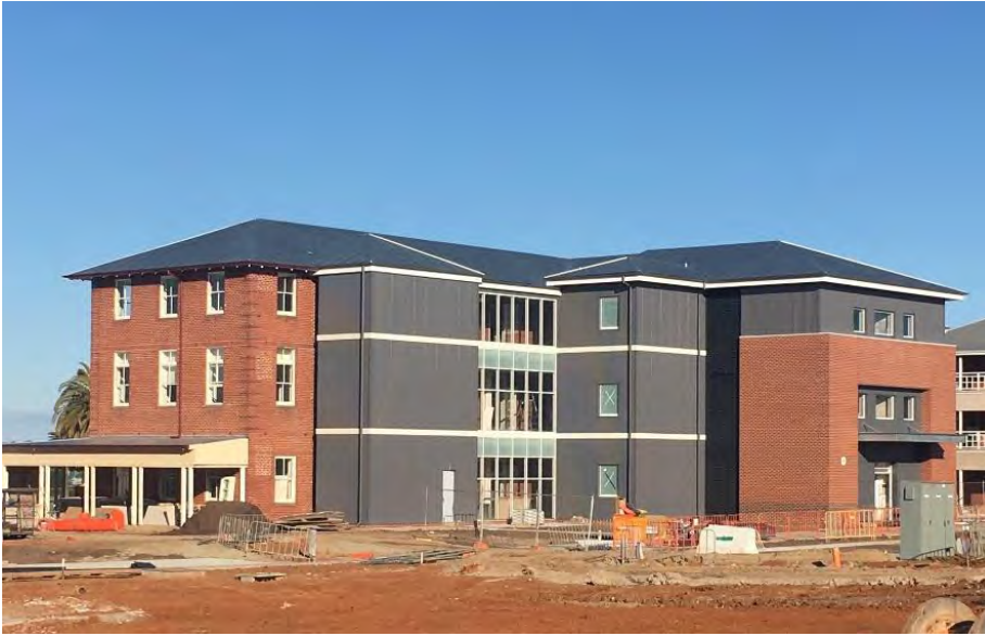
The refurbished B Block

School of Catering and the Maritime Logistics School and the newly formed Maritime Personnel School. These schools will soon relocate from their well-used facilities in A Block to the fully refurbished offices and classrooms in B Block. The vacated A Block will then be redeveloped to provide 54 cabins to accommodate the growth in Junior Officer training at HMAS Creswell that is well underway.