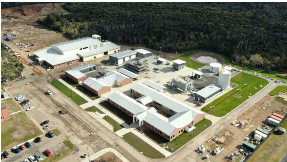
SSSS and SAST viewed from SE - 17 Aug 2020

As you can see by the various photos Cerberus is steadily being transformed and modernised to meet the demand for the increased training throughput in support of the Fleet and the wider ADF. The 100 th Anniversary of the commissioning (opening) of Cerberus will be acknowledged on 1 September with the construction of a small monument adjacent to the Rugby pavilion – it is amazing to think that many of the original buildings are now being refurbished. Hopefully the beautiful red brick buildings will continue to be used for another 100 years at Cerberus – “the Cradle of the Navy”!