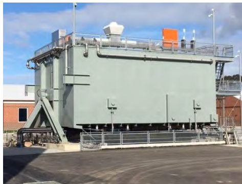
Dynamic Leak Stop Repair Unit

A feature building that is eagerly awaited is the provision of a new Survival at Sea Training Centre. This building will make jumping off the wharf into a chilly Hanns Inlet a distant memory. The new facility will involve abandon ship training with a safety jump to be undertaken from a height of 5m into a 25m x 15m x 5m deep training pool. The pool demonstration area will also include rain, wind and wave simulation to enhance the realism of the training experience. Additional state of the art training aids to be fitted in the coming months include a small boat capsized trainer, a helicopter wet winch recovery capability and a 10m high escape chute to replicate the abandon ship arrangement on an LHD.