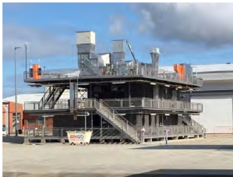
Diesel and Gas Fire Fighting Unit

On the training front, great progress has been made on the construction of the new School of Survivability and Ship Safety (SSSS). The new SSSS training precinct has been constructed north of the Senior Sailor's accommodation area and includes new classrooms, change rooms and office space, a Diesel and Gas Fire Fighting Unit and a Dynamic Leak Stop Repair Unit. The Units will provide training in a much more realistic environment and are also due for completion and handover before the end of the year.