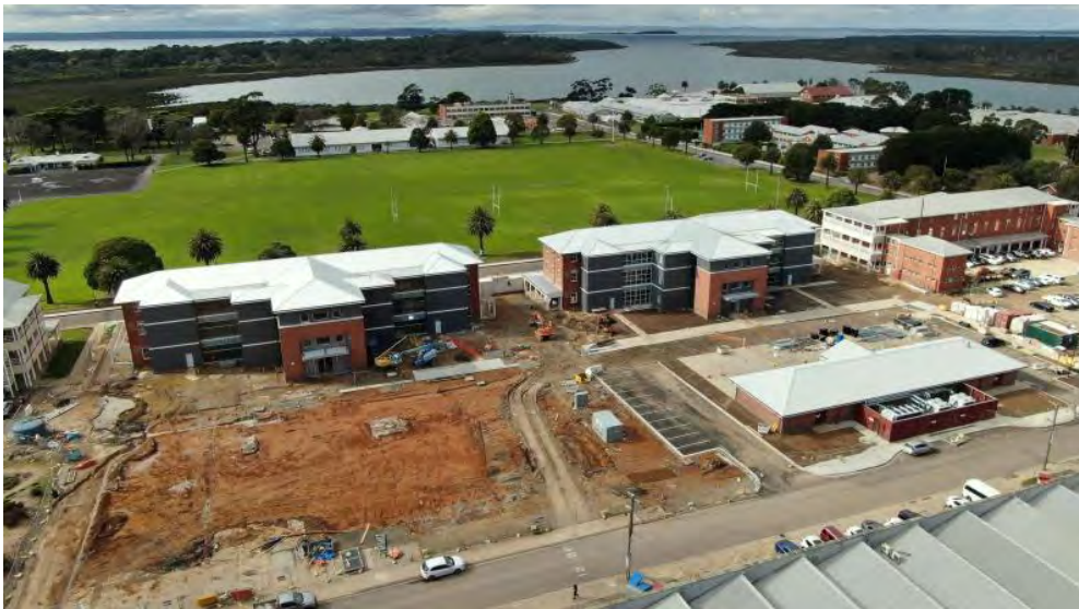
B and C block - 17 Aug 2020