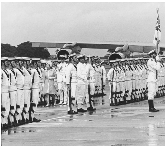
HM Queen Elizabeth II inspecting the Royal Guard and Colour Party paraded for her on arriving at Mascot Airport, Sydney, in March 1970.

Arriving at Mascot Airport, Sydney, on 30 March, HM was again received by a Naval Royal Guard and Band. The occasion was all the more significant for the RAN as it was the first time that the new Queen's Colour, incorporating the Australian White Ensign adopted in 1967, was paraded in her presence.