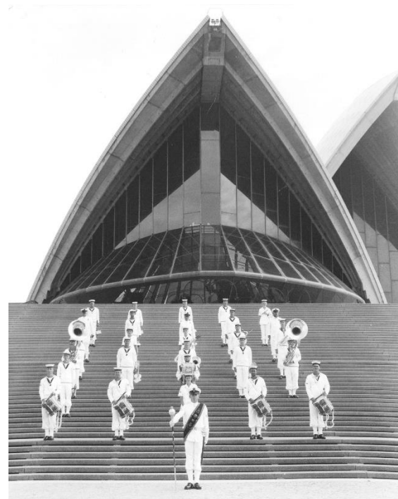
Members of the RAN Fleet Band pose on the steps of the Sydney Opera House.