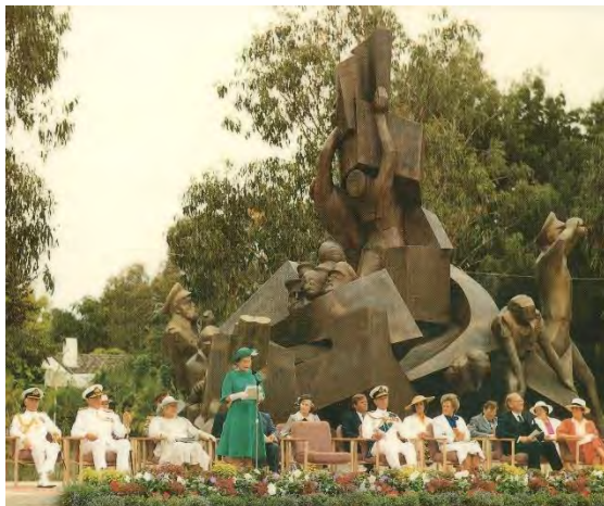
HM the Queen dedicates the RAN memorial on Anzac Parade in Canberra as part of the 75 th Anniversary celebrations.