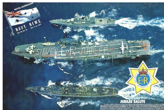
The crew of the RAN's flagship record their participation in Jubilee celebrations on the flight deck of HMAS Melbourne (II). The carrier is escorted by HMAS Brisbane (II) and HMNZS Canterbury en-route to the UK.