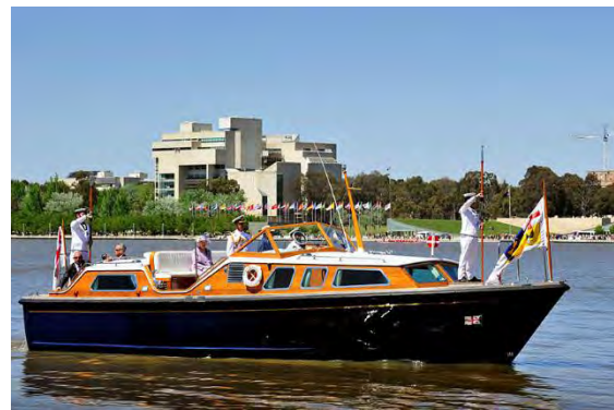
The Royal barge conveys HM and HRH Prince Philip across Lake Burley Griffin in October 2011.

The Queen's 16 th visit to Australia took place during the period 19-29 October 2011 beginning in Canberra when the Royal aircraft touched down at Fairbairn air base. There HM was received by the Australian Federation Guard and a 21 gun Royal salute. The following day the RAN's VIP boat squadron conveyed HM and Prince Philip across Lake Burley Griffin from Government House to Commonwealth Park. The appearance of an admiral's barge on Canberra's lake, with the Royal couple embarked generated great interest and HM remarked to its crew on how much she enjoyed the 25 minute journey.