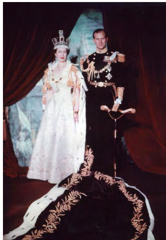
HM and the Duke of Edinburgh pose for a coronation portrait in June 1953

The new queen's Coronation took place in Westminster Abbey on 2 June 1953 with prime ministers, leading citizens of Commonwealth countries and representatives of foreign states gathering to mark the occasion and pay their respects. Elsewhere crowds of people lined the procession route in spite of heavy rain. A contingent of Australian Armed Forces personnel was also in attendance most of whom had taken passage to England in the aircraft carrier HMAS Sydney (III) as part of an official coronation contingent. In a world first, the coronation ceremony was also broadcast on radio and television around the world.