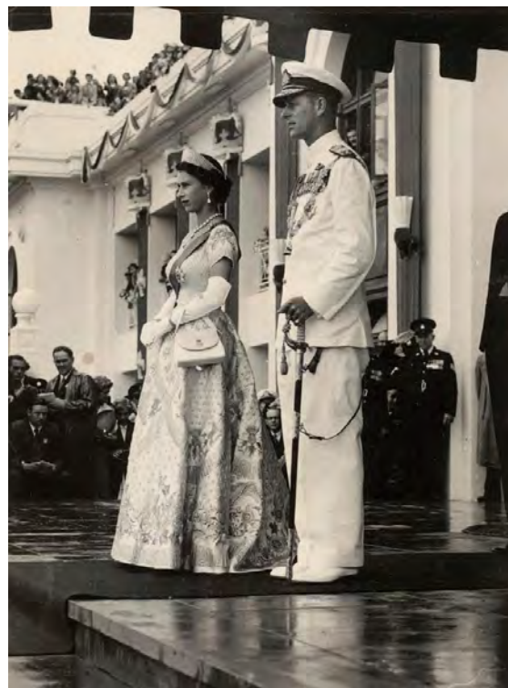
HM and the Duke at Parliament House in Canberra during the 1954 Royal Tour

Throughout the official tour, the RAN assumed many responsibilities to ensure the Royal couple's safety including sea patrols during Royal overflights and the provision of HMAS Anzac (II) as an official escort to the Royal Yacht Britannia .