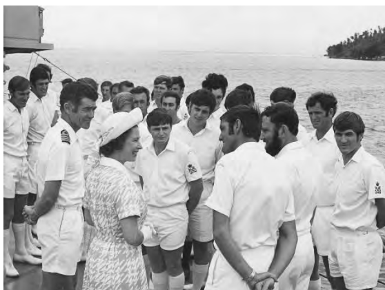
HM meeting some crew members of HMAS Torrens during the Royal tour of the South Pacific in 1974.

'Thank you for your escort. I was most impressed by the admirable way in which you carried out your duties, the smart appearance of your ship and by your steampast.'