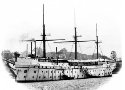
HMAS Tingira, her topmasts gone and in her new white livery as a training ship.

Recruits for the Royal Australian Navy were trained exclusively on board Tingira until 1925, when the Recruit School was established at HMAS Cerberus .