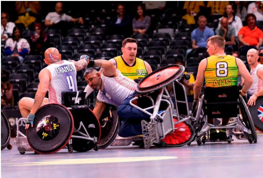
Competition is fierce in the Wheelchair Basketball.

athletics and the first round of wheelchair rugby as well as the first day of swimming. Day three our rowers took to the stadium and our wheelchair basketballers were able to get on the court for a solid training session and our wheelchair rugby team came away with a bronze medal beating France. Wheelchair basketball and powerlifting took centre stage on Thursday and the week finished off with a spectacular day of cycling on the Friday.