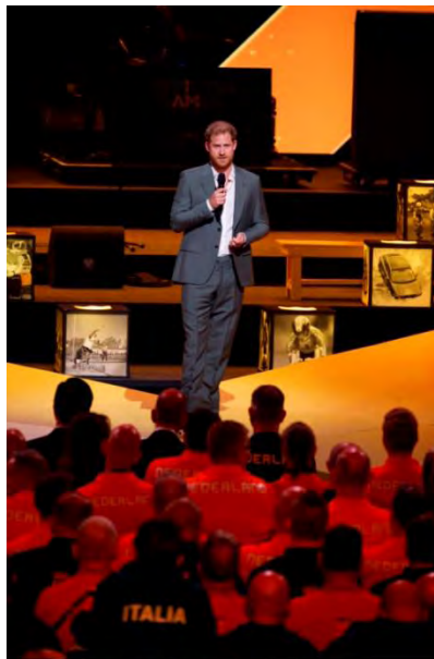
Prince Harry, the Duke of Sussex, addresses the Invictus Games competitors at the Opening Ceremony.

The games were officially opened on Saturday 16 April with a spectacular opening ceremony which was televised live throughout Europe. The night was an opportunity for nations to come together, to celebrate determination, honour and resilience. These games had been twice delayed, and the competitors weren't sure they would get here and yet there was Team Australia, entering the stadium to a rousing reception. Prince Harry, Patron of the Invictus Games and his wife Meghan both gave rousing speeches to an enthusiastic audience. The highlight of the evening would have to be the entrance of the Ukraine team. The stadium rose as one, as the team left the battlefield to participate in the games. It was the first time that many of the competitors had seen their families since Russia invaded their country. It was sad to know that one of their competitors had been killed and another captured and was a POW in Russia prior to the start of the games. The music, presentations and lighting were breathtaking as the games were officially opened.