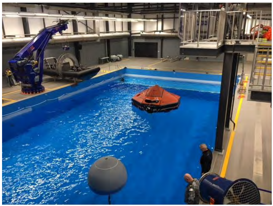
Note the wave ball and wind fans used to simulate inclement weather.

area, which consists of a 25m x 15m x 5m deep practical training pool. The pool enables Recruits to simulate abandoning ship from the starboard waist of an FFH. Upon entering the water life jackets automatically inflate, the trainee climbs into a life raft and is eventually wet winched from the water. Environmental factors can be simulated which include a .75m high wave, rain, 60 knot winds and night conditions. Additional training is provided in a 7.2m Rigid Hull Inflatable Boat (RHIB) capsize simulator and a 10m high Marine Evacuation System chute to simulate abandoning ship from an LHD.