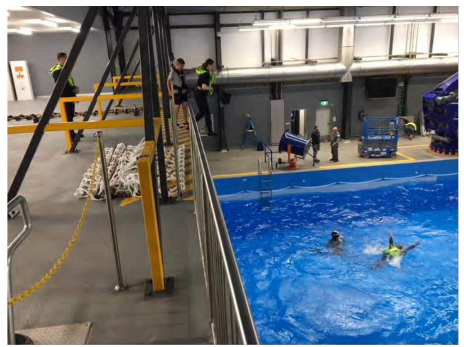
Undergoing Water Entry training

The RHIB capsize simulator is based on the same technology as the Helicopter Underwater Escape Training (HUET), which uses a crane and ring which rotates the module, with the RHIB installed inside the rotating steel ring. The RHIB capsize trainer was installed by a Canadian Company, Survival Systems Limited (SSL), and is understood to be the first of its kind in the world.