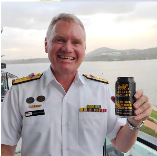
What better way to celebrate than with a premiership beer.