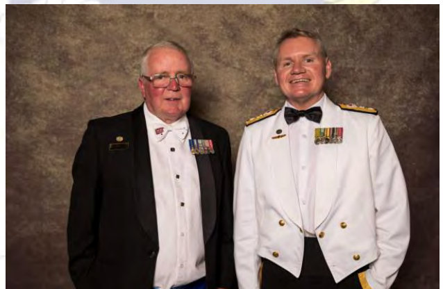
Father and Son

The Naval Historical Society of Australia consists of a National Office on Garden Island in Sydney, and Chapters in Victoria, Western Australia and the ACT. We held our AGM in October but the National AGM is being held