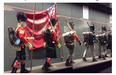
Exhibits at the new Waterloo museum

In May 2015 a 'New underground Battle of Waterloo memorial Museum' was opened and the purpose of my