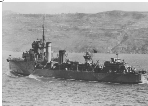
HMAS Voyager off Crete