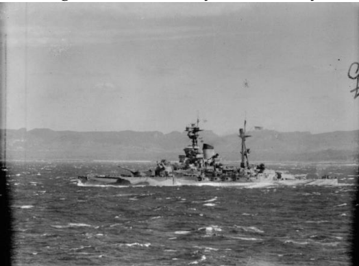
HMS Ramillies supporting the Allied landings

We begin our summary of his diary entries on April 9th 1940 in Sydney awaiting his draft. He