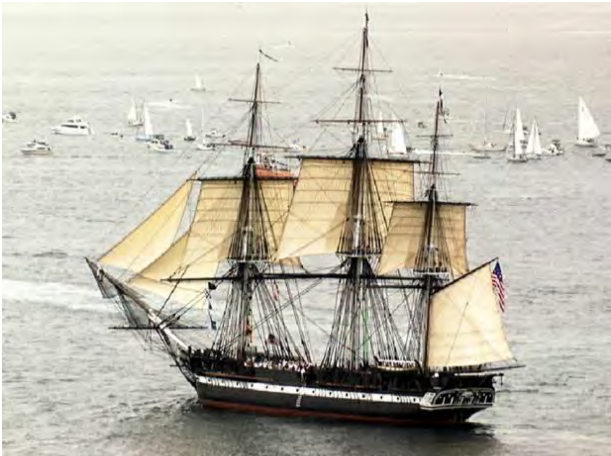
The U.S.S. Constitution (Old Ironsides)

"On July 27, 1798, the U.S.S. Constitution sailed from Boston with a full complement of 475 officers and men, 48,600 gallons of fresh water,