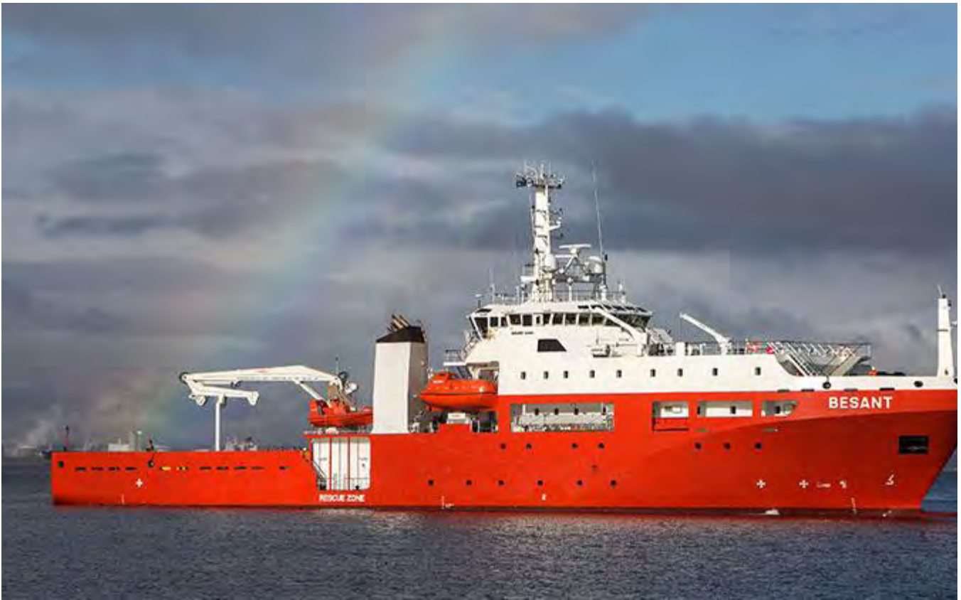
MV Besant in Cockburn Sound