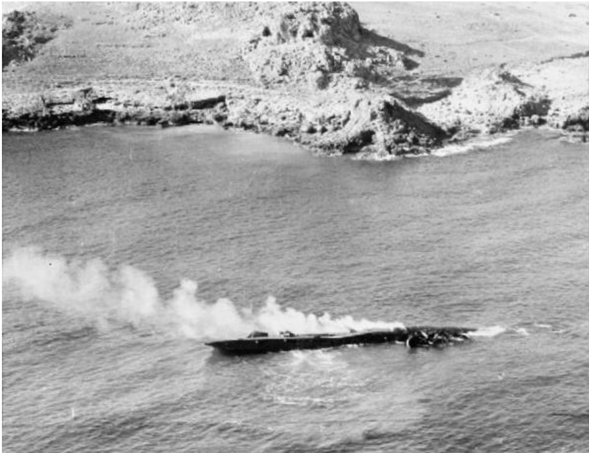
U617 on fire and lying on her port side after being beached off the Moroccan coast near Melilla. The wreck was eventually destroyed by further air attacks and naval gunfire by British units including HMAS WOLLONGONG.

HMAS WOLLONGONG J172, the first so named for the RAN, was followed by two more of the same name with the second a Fremantle Class Patrol Boat, FCPB206, serving from 1981-2006. The third and current HMAS WOLLONGONG 92, is an Armidale Class Patrol Boat, one of 15 built for the RAN by Austal Ships of Henderson in Western Australia. The 300 ton displacement 186 feet long Patrol Boat is based at her home port in Far North Queensland at HMAS CAIRNS, she is currently actively engaged in patrolling Australia's Northern waters where she answers to her motto "Heed the Call".