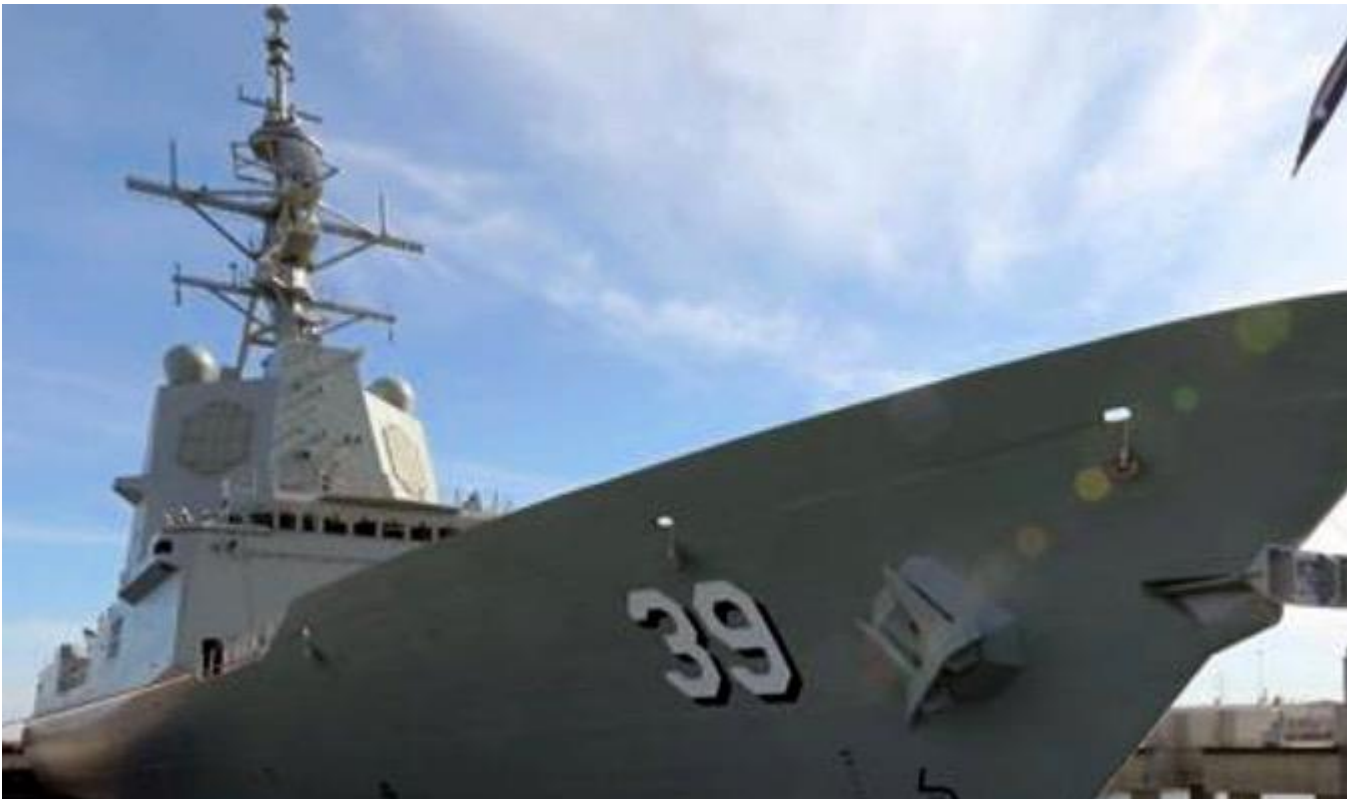
NUSHIP HOBART DDG39 AIR WARFARE DESTROYER