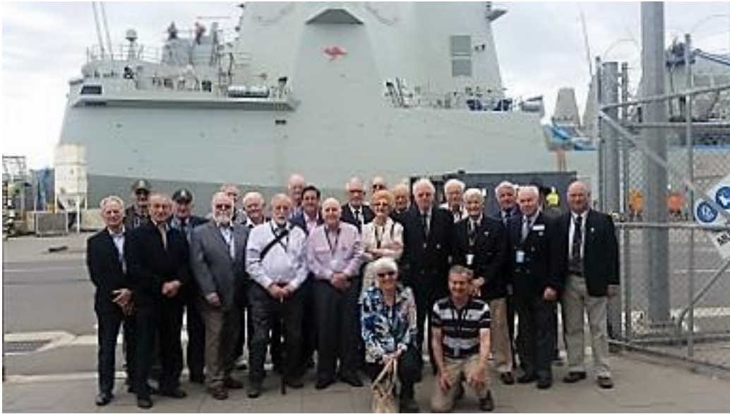
NLA DELEGATES VISIT OSBORNE S.A. SHIPYARD, WITH NUSHIP HOBART IN BACKGROUND AND DELEGATES AT AGM ADELAIDE DINNER OCTOBER 2016