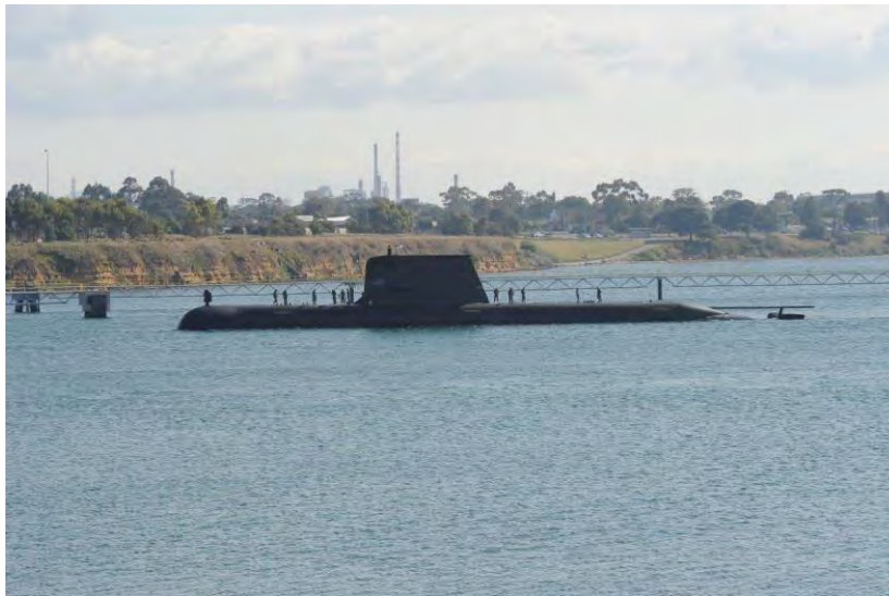
HMAS RANKIN ARRIVING GEELONG 2015

The last visit to Melbourne by an RAN submarine was that of the lead boat of the class, HMAS COLLINS, five years ago in October 2010, at that time under the command of CMDR Glen Miles. The following images show HMAS RANKIN arriving in Geelong November 2015.