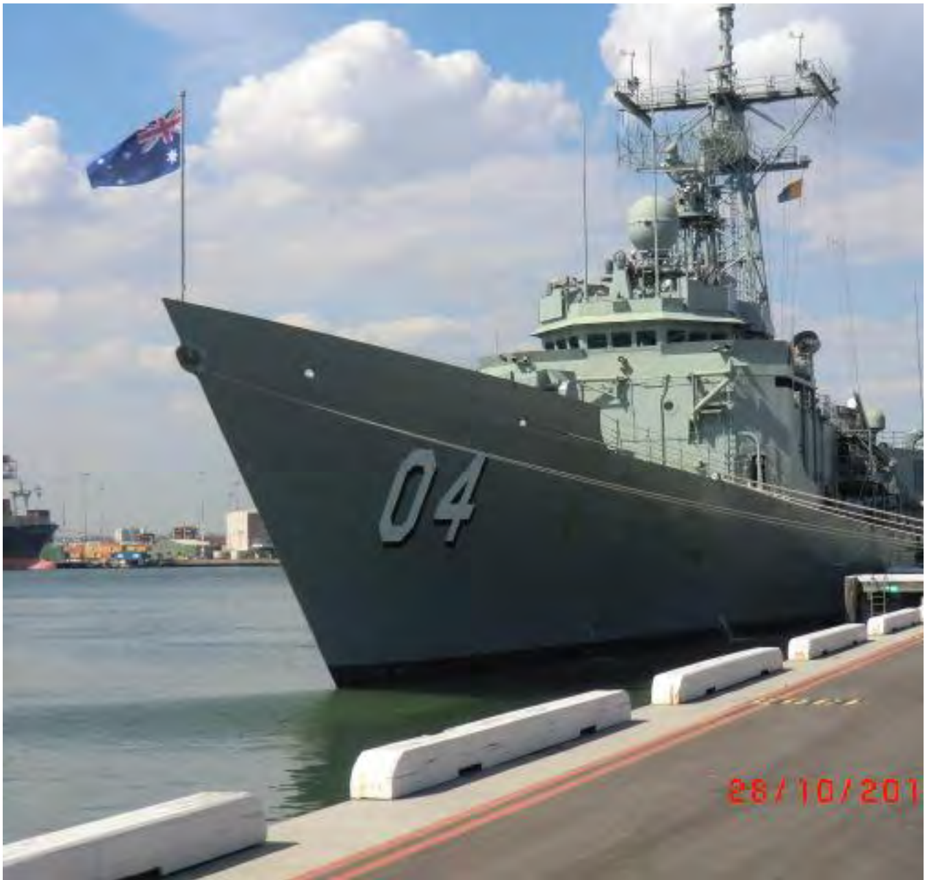
HMAS DARWIN ALONGSIDE SOUTH WHARF