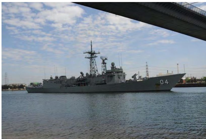
HMAS DARWIN ARRIVING MELBOURNE 2015

It sailed on Sunday 1 November and will leave for another six month deployment to the Middle East in December this year.