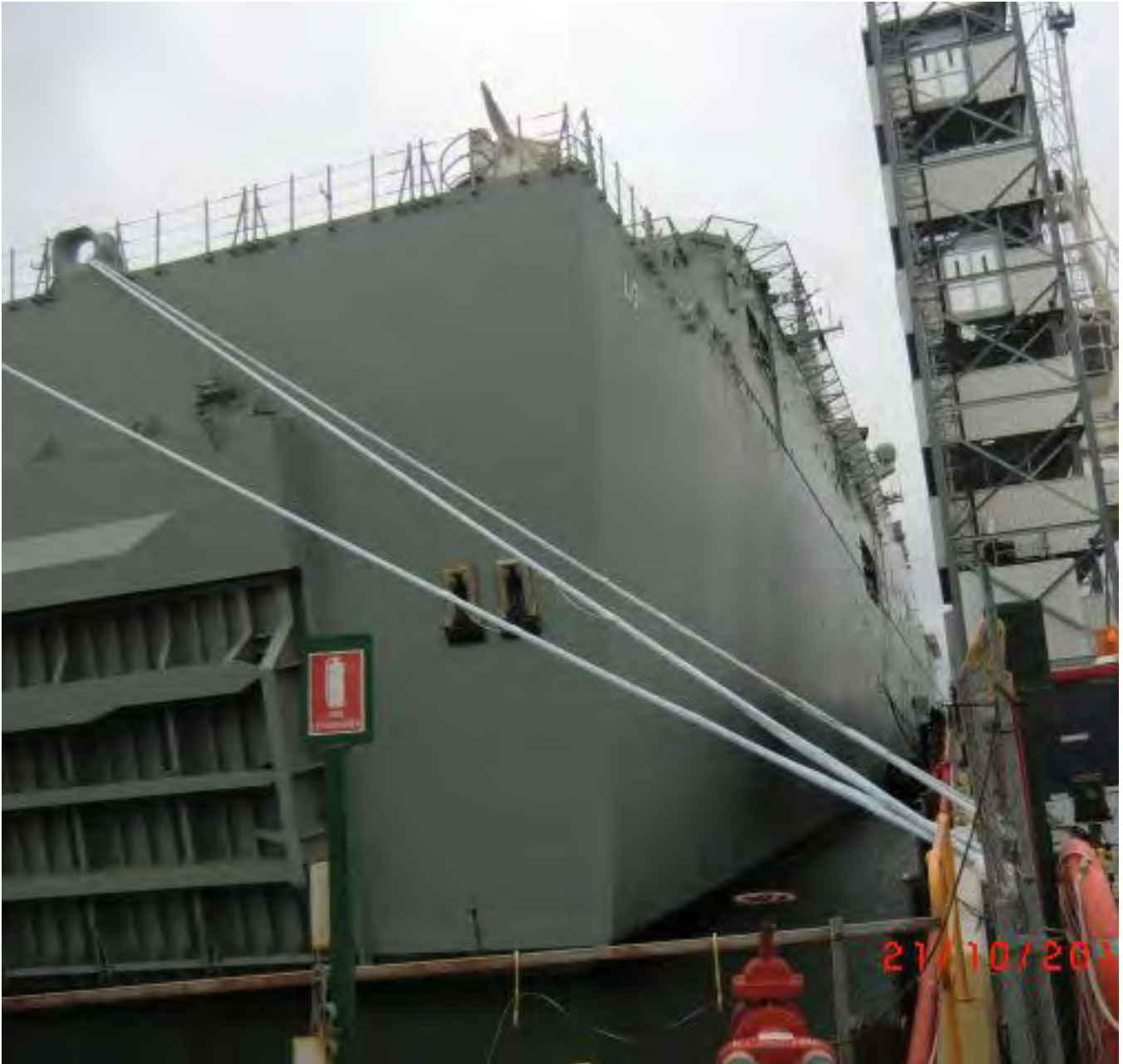
NUSHIP ADELAIDE ALONGSIDE BAE WILLIAMSTOWN 2015