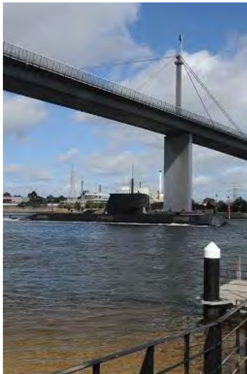
HMAS FARNCOMB PASSES WESTGATE BRIDGE TO BERTH AT SOUTH WHARF