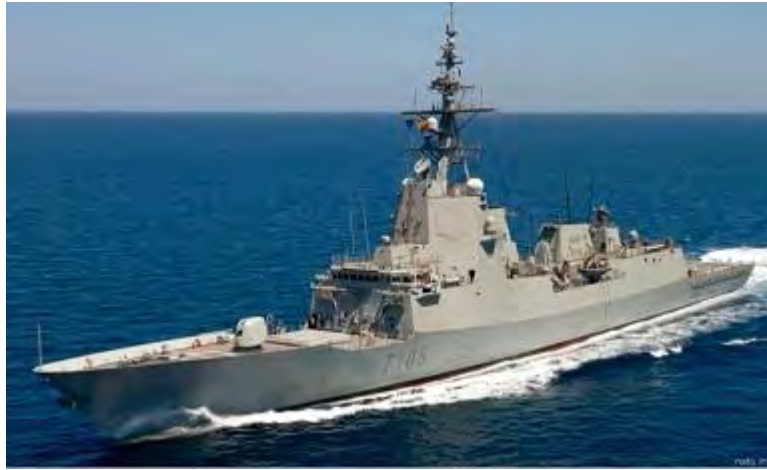
SPS CRISTOBAL COLON F105