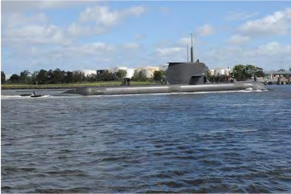
COLLINS CLASS SUBMARINE HMAS FARNCOMB ARRIVING IN MELBOURNE FROM HOBART TASMANIA 31 ST OCTOBER 2016