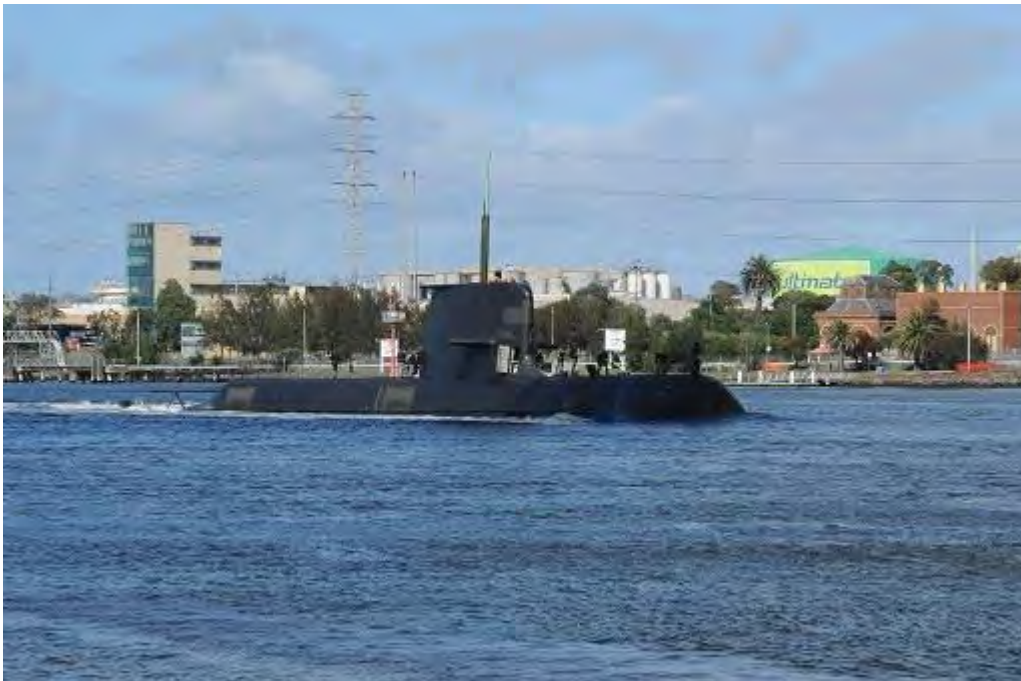
HMAS FARNCOMB ON YARRA AT FISHERMANS BEND MELBOURNE