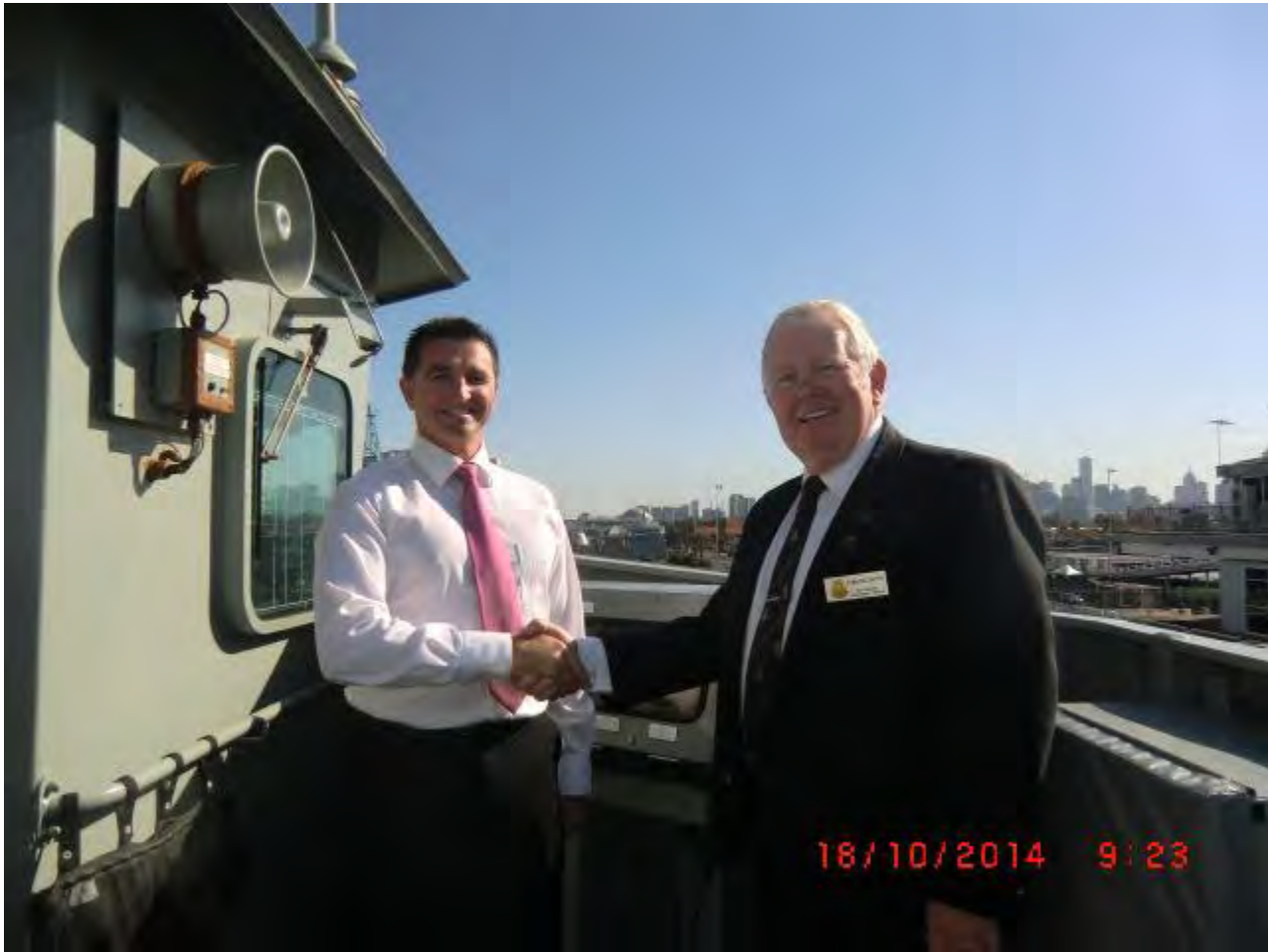
COMMANDING OFFICER OF HMAS ARUNTA (LEFT) WITH EDITOR ON BRIDGE WING OF HMAS ARUNTA OCTOBER 2014 PORT MELBOURNE