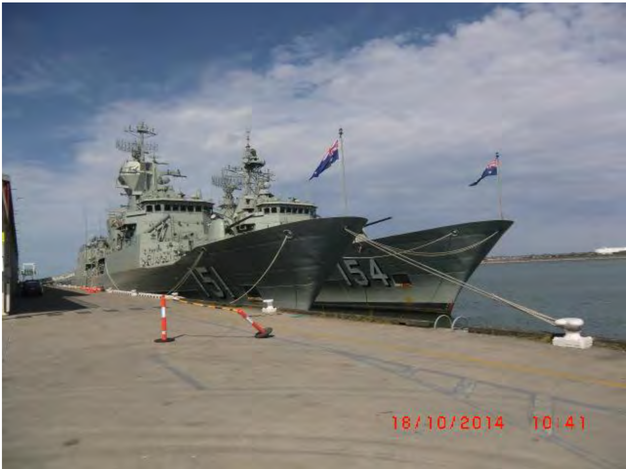
HMAS ARUNTA 151 WITH HMAS PARRAMATTA 154 AT PORT MELBOURNE OCTOBER 2014

HMAS ARUNTA met with other units of the RAN in Albany, including HMA ships SIRIUS, ANZAC STUART and the submarine HMAS RANKIN. They in turn were joined by the New Zealand Anzac Frigate HMNZS TE KAHA and the Japanese destroyer KIRISAME during which time the naval vessels were engaged in exercise " Distant Shores ", plus further commemorations of the centenary of the first convoy of 38 total transports carrying troops, nurses, weapons, supplies and horses onward to Egypt and WWI, 100 years ago in November of 1914. The 1914 convoy was escorted by the British cruiser HMS MINOTAUR, the RAN'S HMA ships SYDNEY and MELBOURNE and the Japanese Battle Cruiser IJS IBUKI. It was on this deployment that HMAS SYDNEY would do battle with, and defeat, the German Cruiser EMDEN off the Cocos Islands. Refer to this editions Naval History Page.