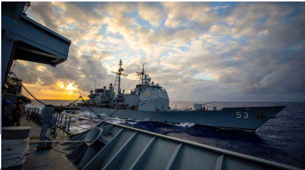
HMAS Supply conducts replenishment at sea with US Navy cruiser USS Mobile Bay during Exercise Rim of the Pacific (RIMPAC) 2022. Story by Leading Seaman Kylie Jagiello.