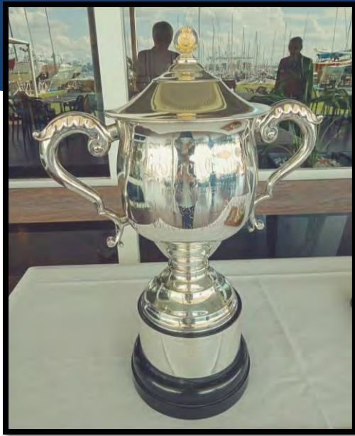
Geoffrey Evans Trophy