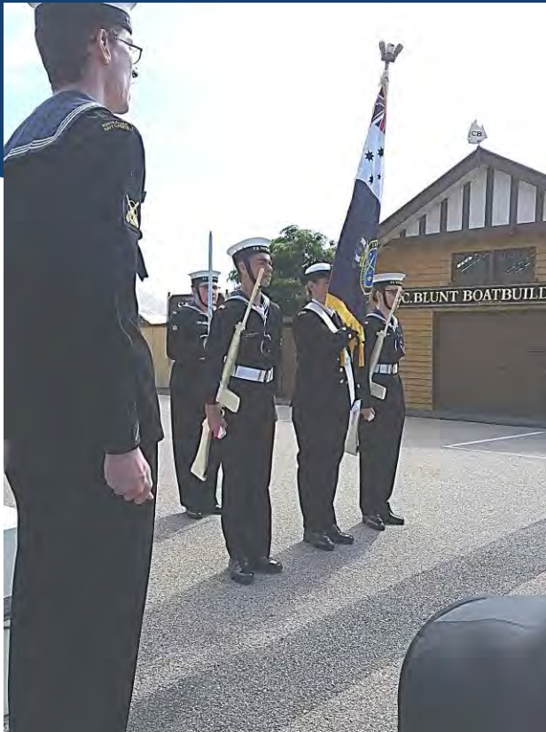
Ceremonial Bearing Colours