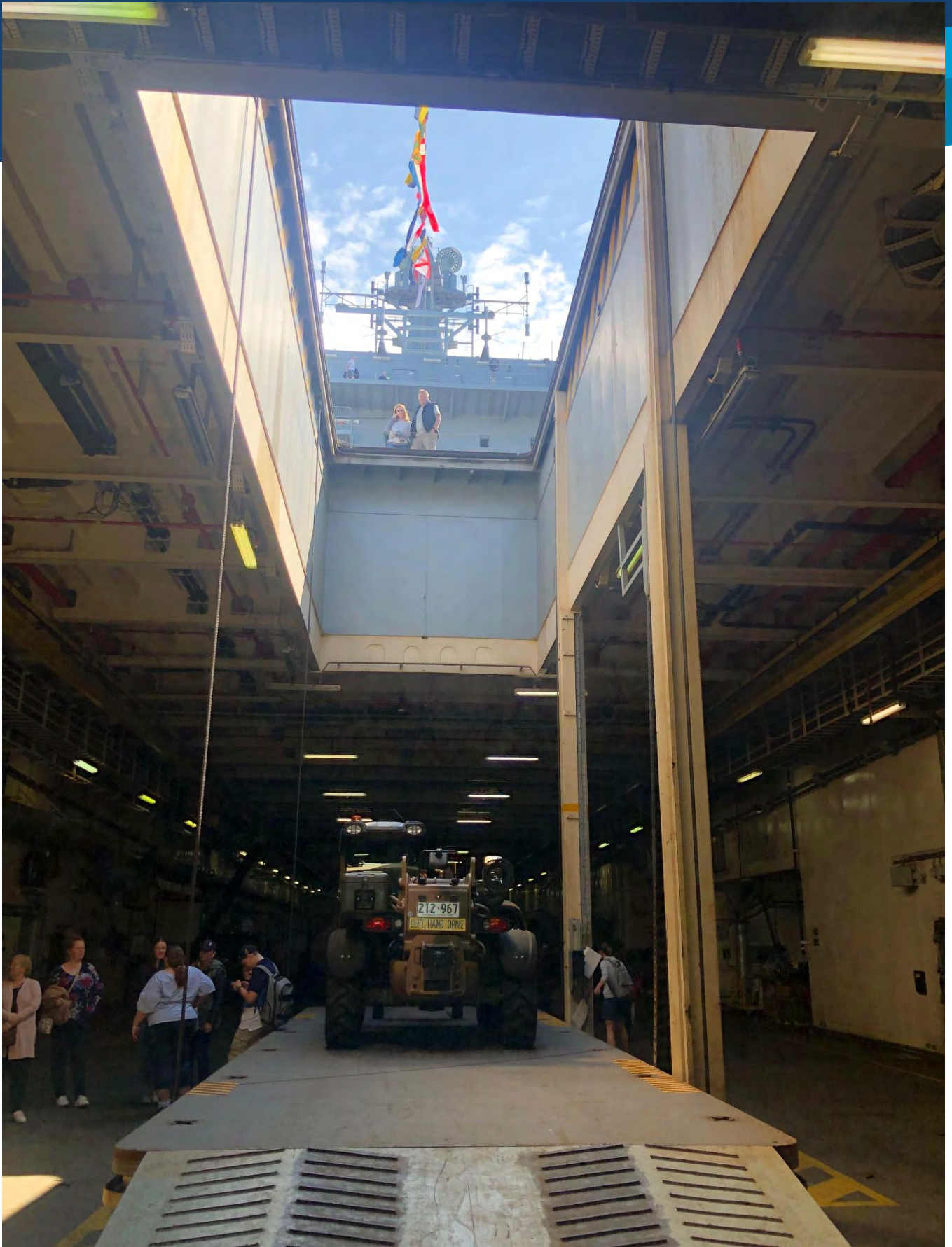
Hold of HMAS Choules