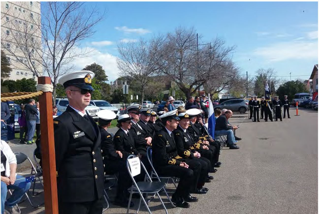
Attendees at the National Assessment