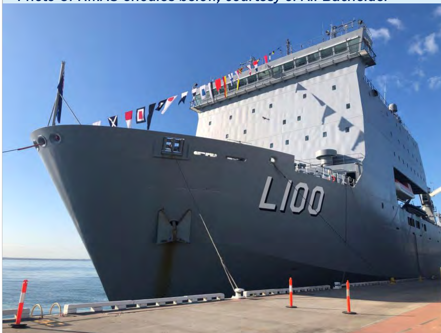
Photo Of HMAS Choules below