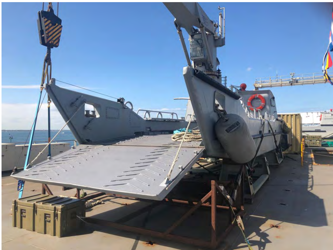
Landing craft HMAS Choules