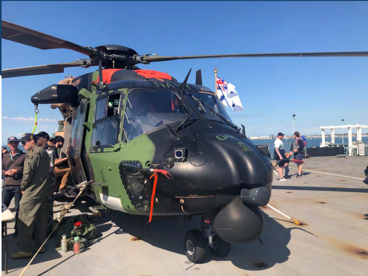
Helicopter on display HMAS Choules