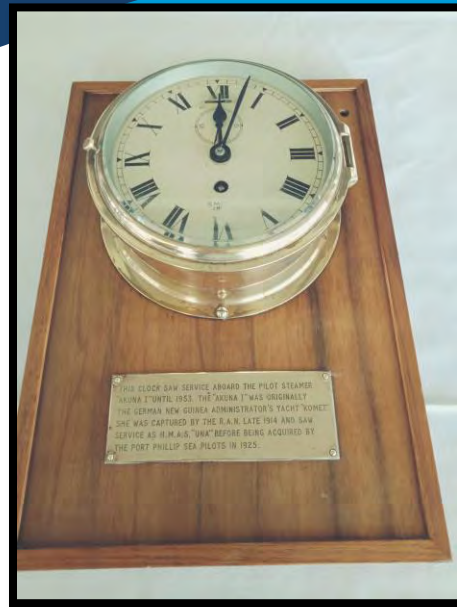
Navy League Trophy