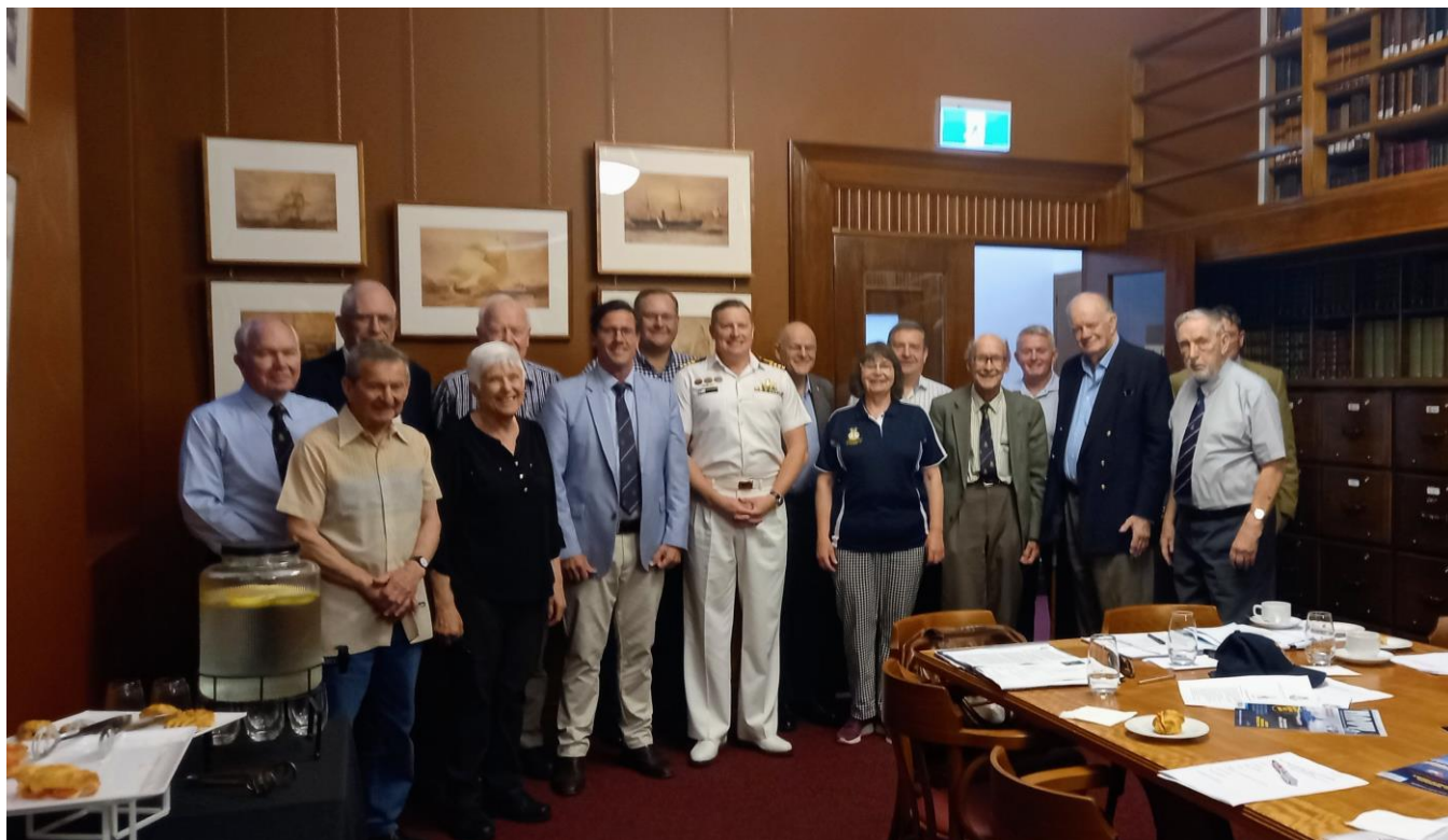
Attendees at the Federal Council meeting and AGM 21 October 2023

The Navy League Federal Council meeting was held on 21 October 2023 in Sydney at the State Library. All Divisions were represented with the exception of Western Australia.