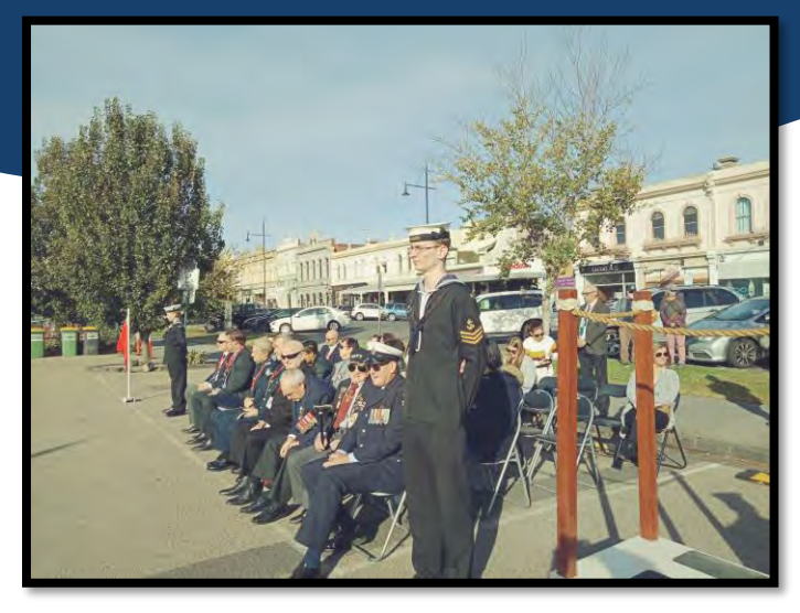
Invited guests to the T S Voyager Annual Review