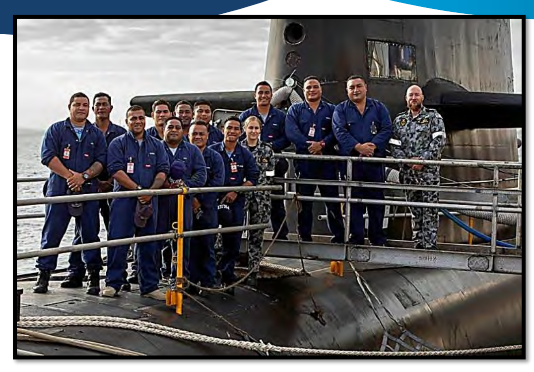
Officers of the Tuvaluan Maritime Police visit HMAS Dechaineux at HMAS Stirling.

With their beautiful, harmonious singing and a new Guardian class Patrol Boat, the maritime surveillance unit of the Tuvalu Police Force brought a distinct Pacific Island feel to Fleet Base West.