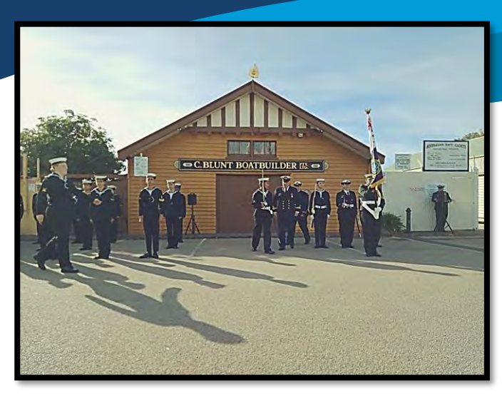
Parade of TS Voyager cadets.