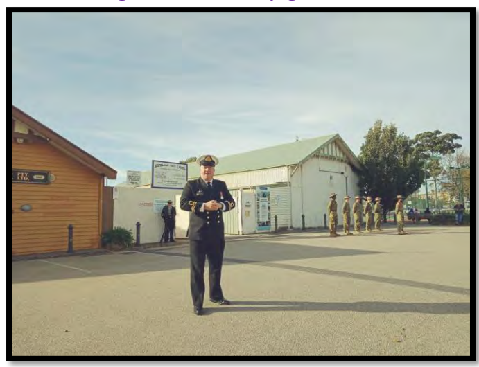
Speech by the Flotilla Commander