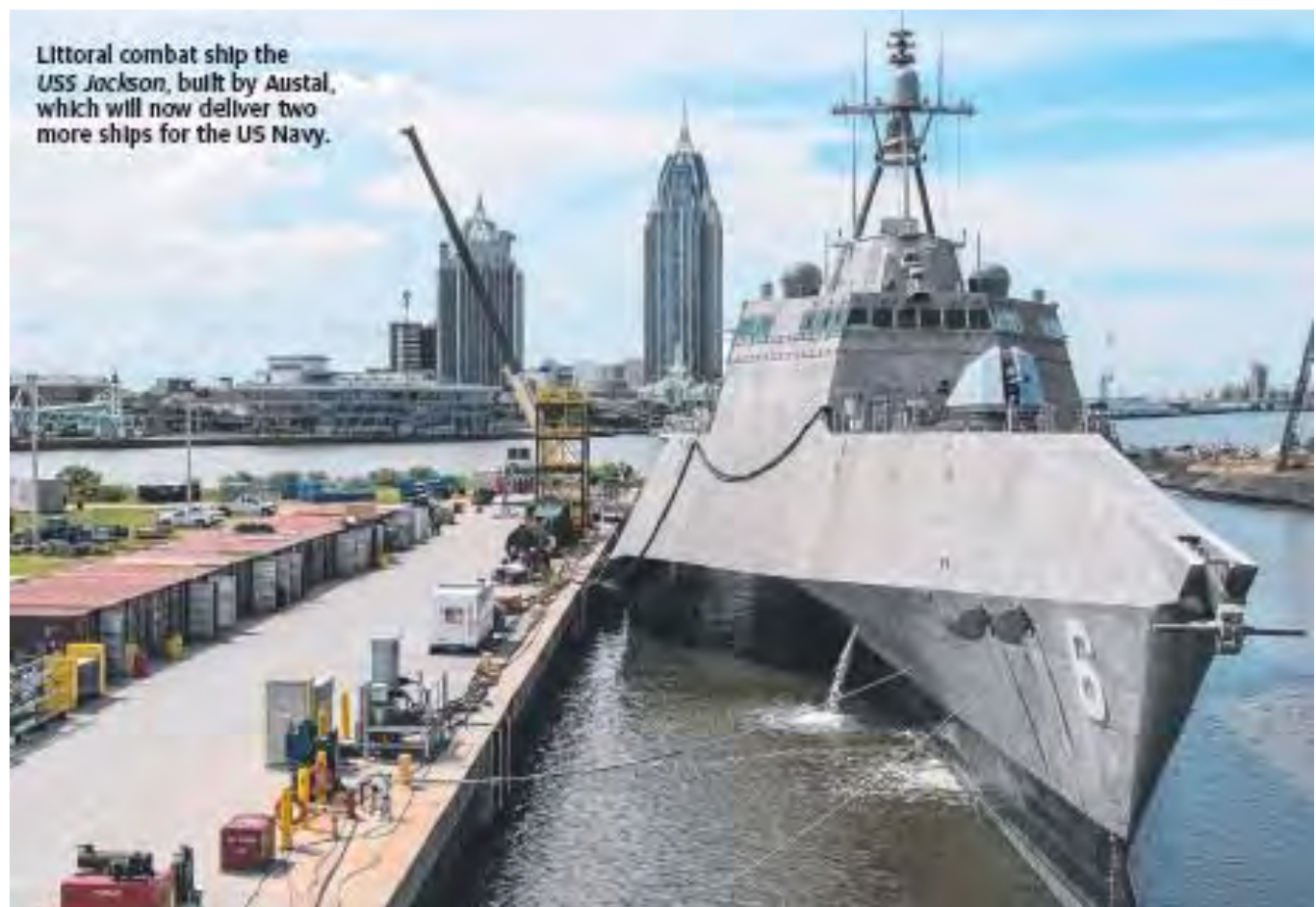
Littoral combat ship the USS Jackson, built by Austal, which will now deliver two more ships for the US Navy.