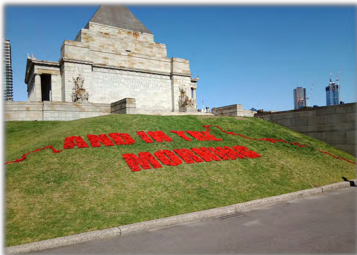
Knitted Poppies depicting part of The Ode

Below are photos of the venue and the 11am service.