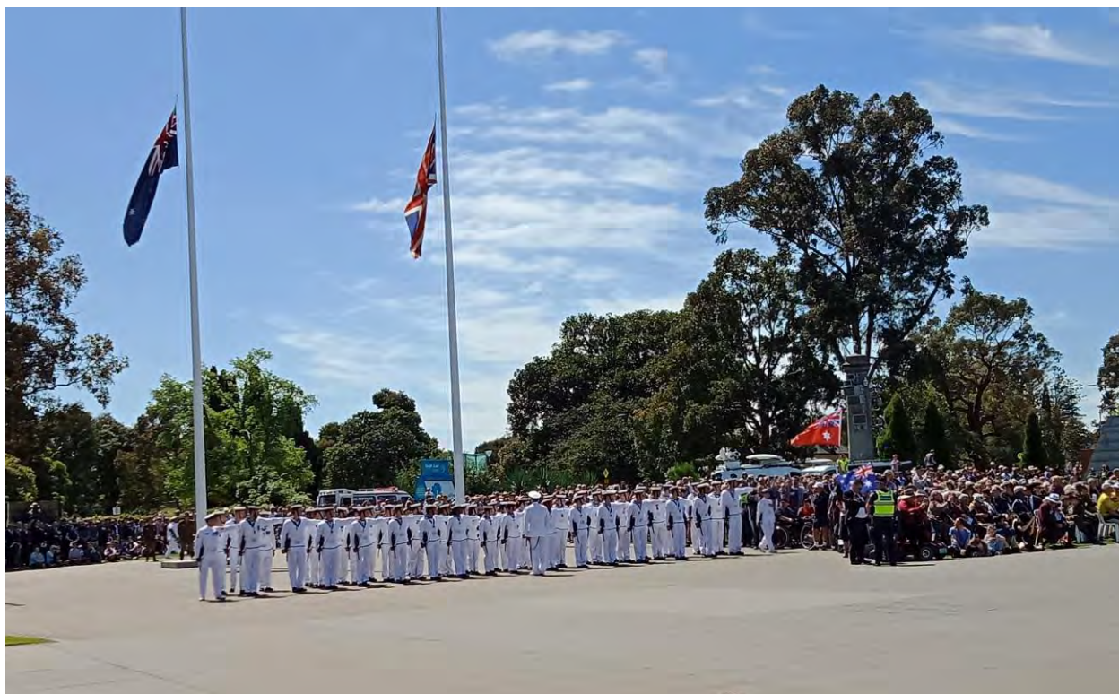
HMAS Cerberus armed guard