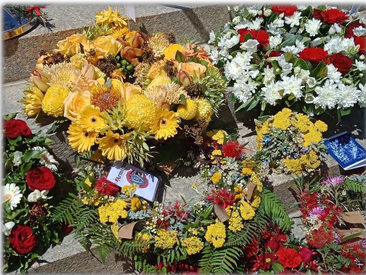
Some of the lovely wreaths