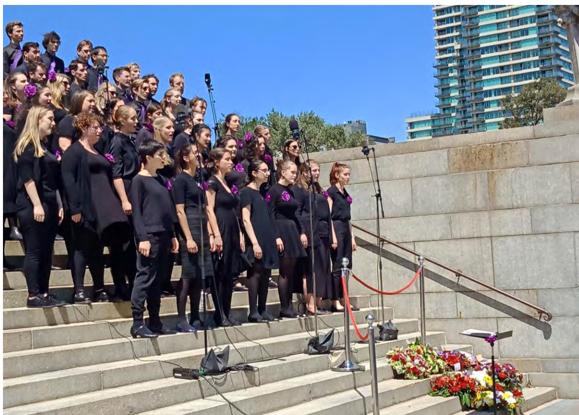
The wonderful Exaudi Choir