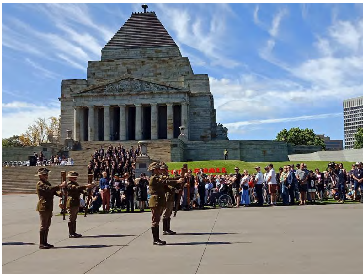
Shrine Guards formed the Catafalque Party