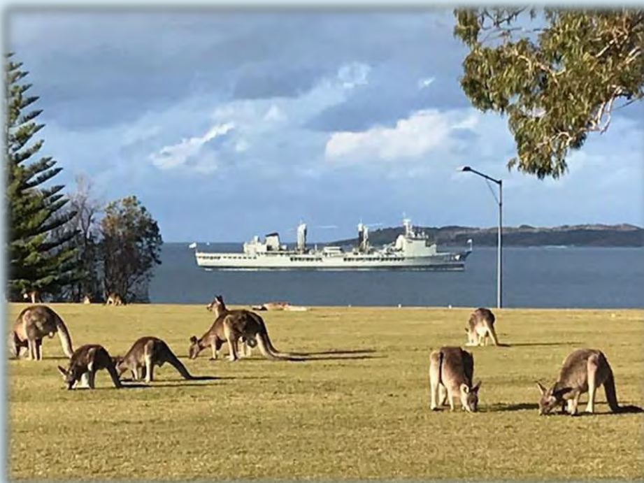
Magnificent picture from Rex Williams of HMAS Success off Jervis Bay