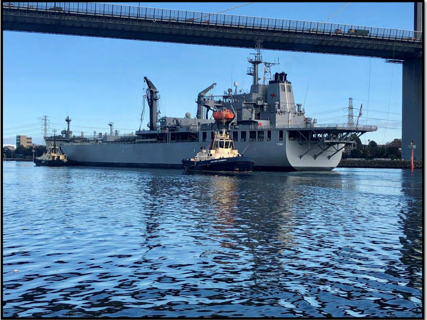
Farewell HMAS Sirius