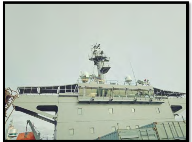
Foremast and bridge from container deck