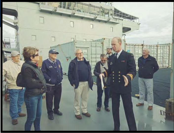
Containers on deck