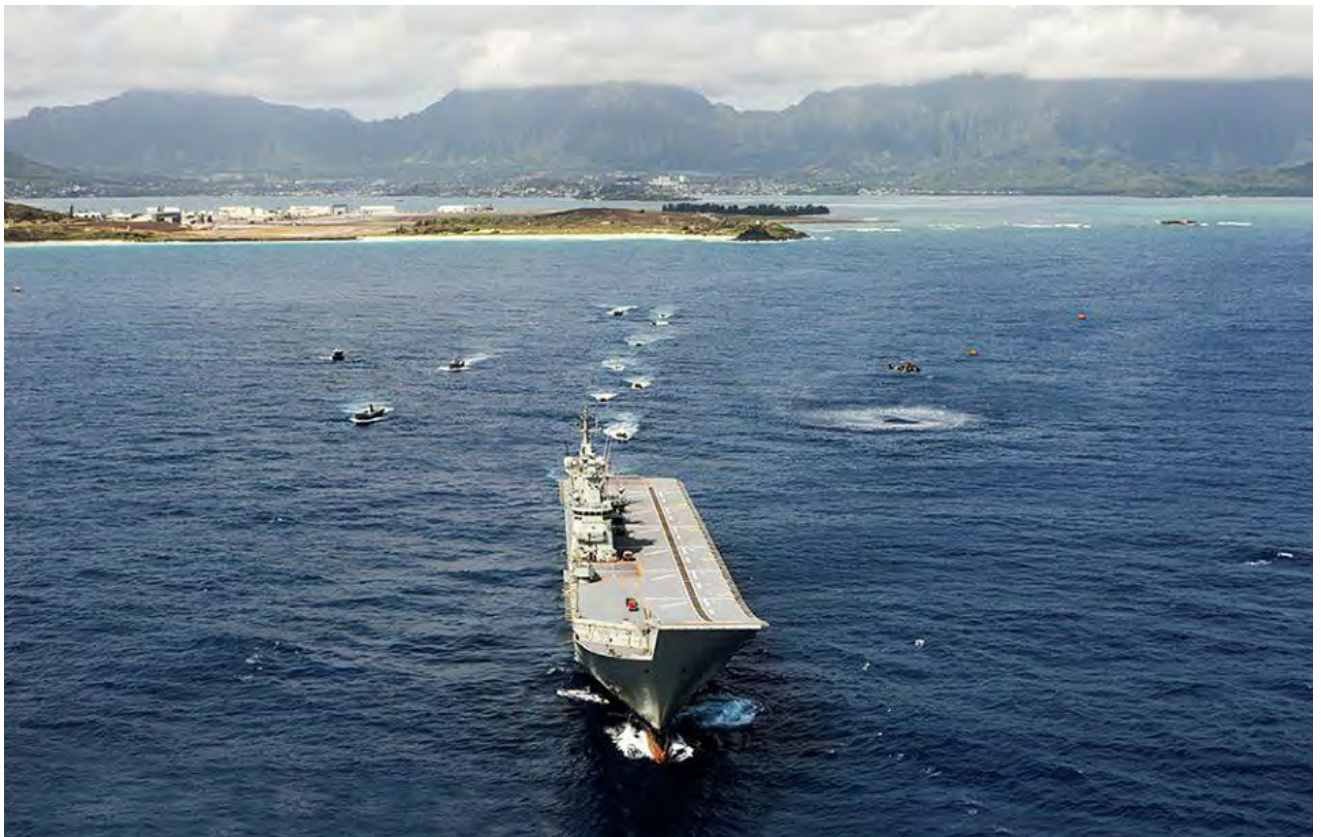
HMAS Adelaide waits for United States Marine Corps amphibious assault vehicles to embark during Exercise Rim of the Pacific 18, Hawaii. Image digitally altered.