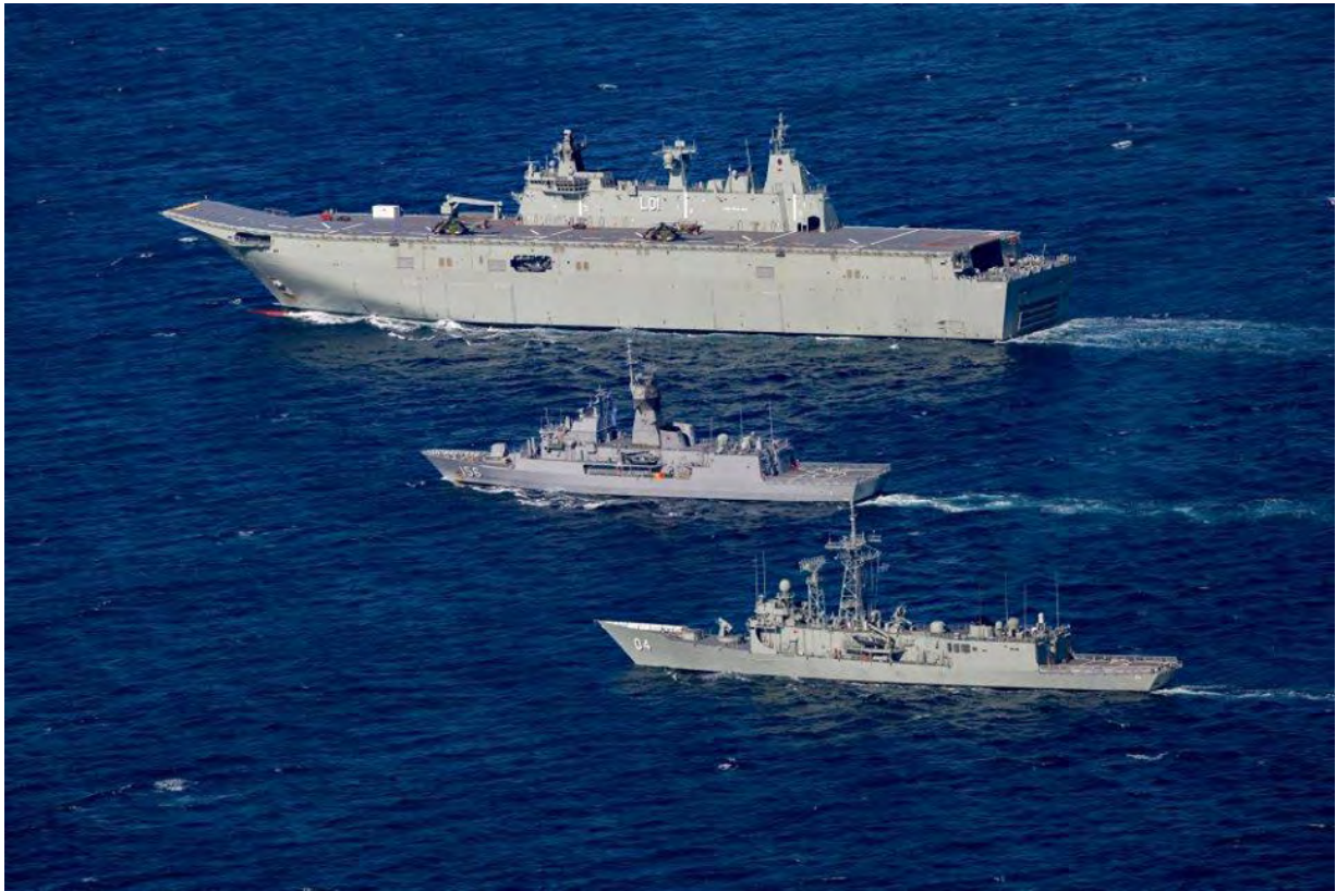
HMA Ships Adelaide, Toowoomba and Darwin in formation off the coast of Sydney #AusNavy