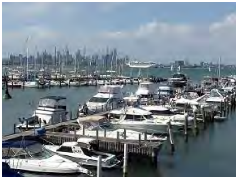
VESSELS OF THE RVMYC MOORED AT WILLIAMSTOWN