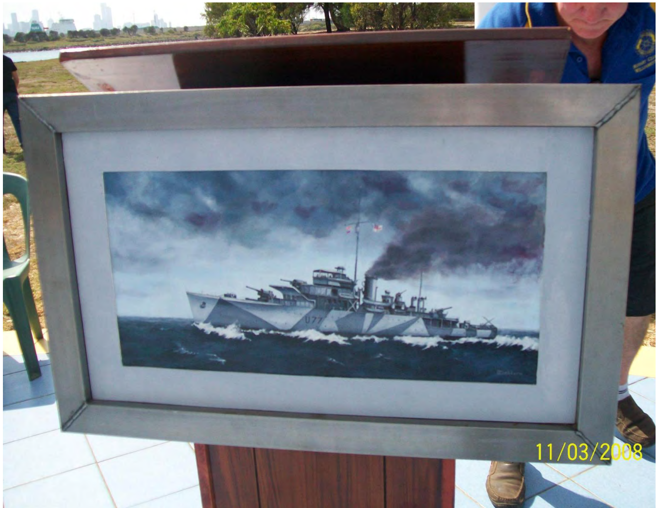
HMAS YARRA (II) PAINTING