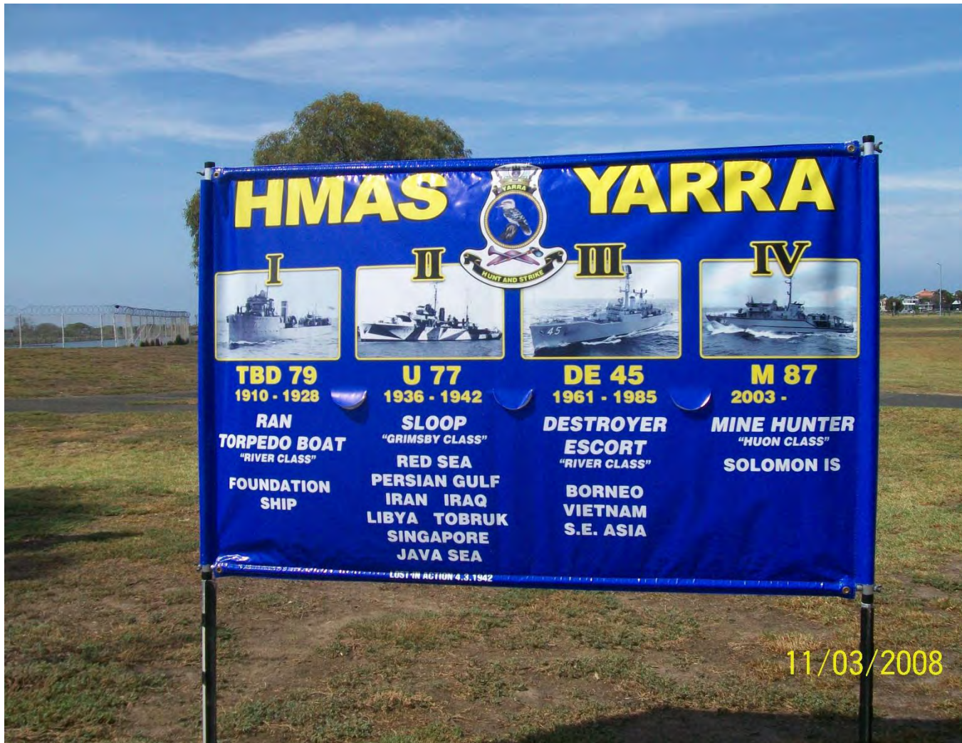
HMAS YARRA (II)