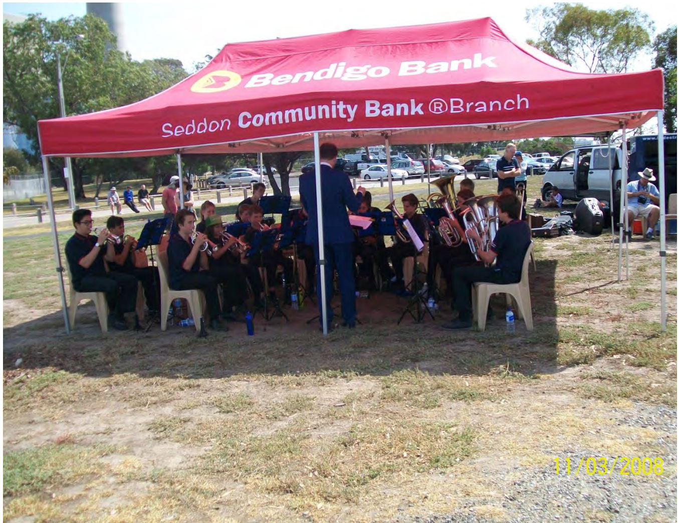
HYDE STREET SCHOOL BAND AT HMAS YARRA COMMEMORATION