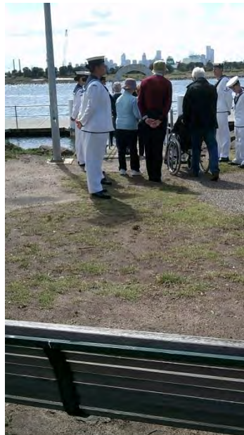
The Guard of Honour at the Memorial Jetty. The Official Party.