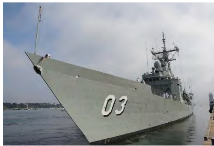
HMAS SYDNEY FFG03