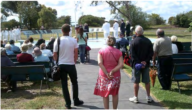
HMAS “Yarra” memorial service, 1 st March 2015. The official ceremony.