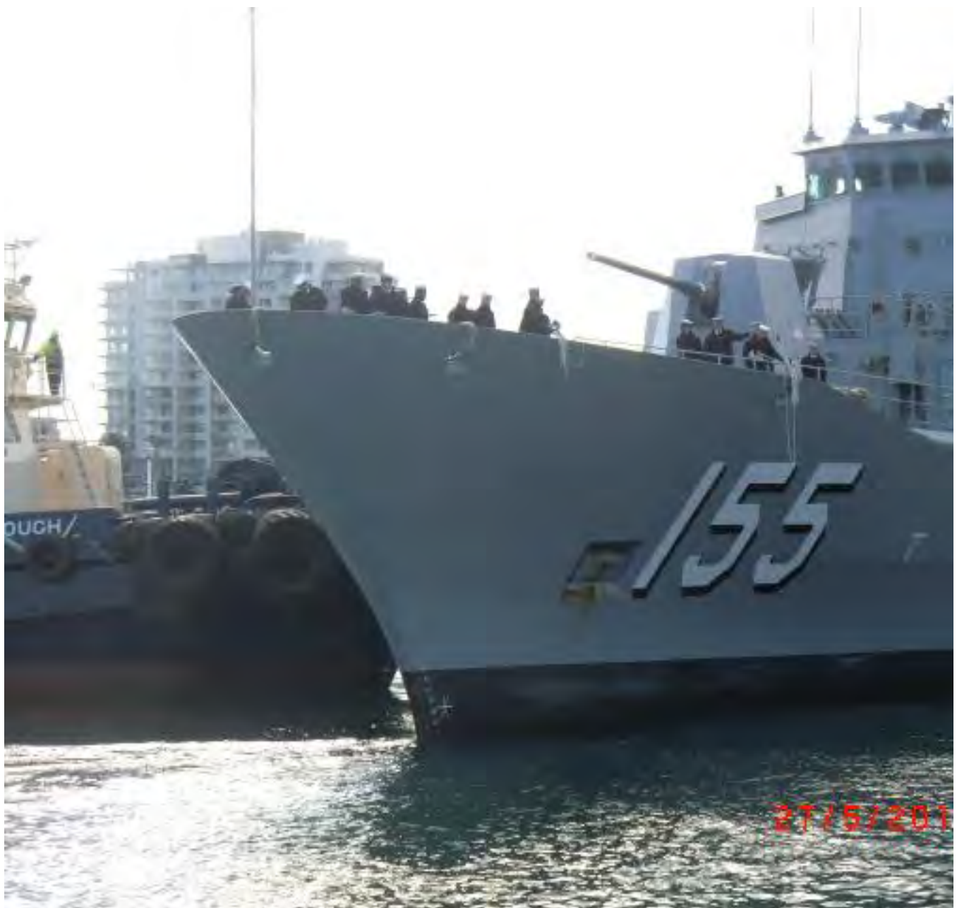
HMAS BALLARAT ARRIVING AT PORT MELBOURNE