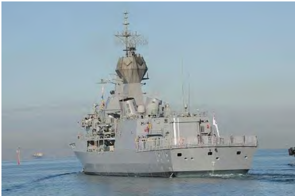
HMAS BALLARAT DEPARTING PORT MELBOURNE