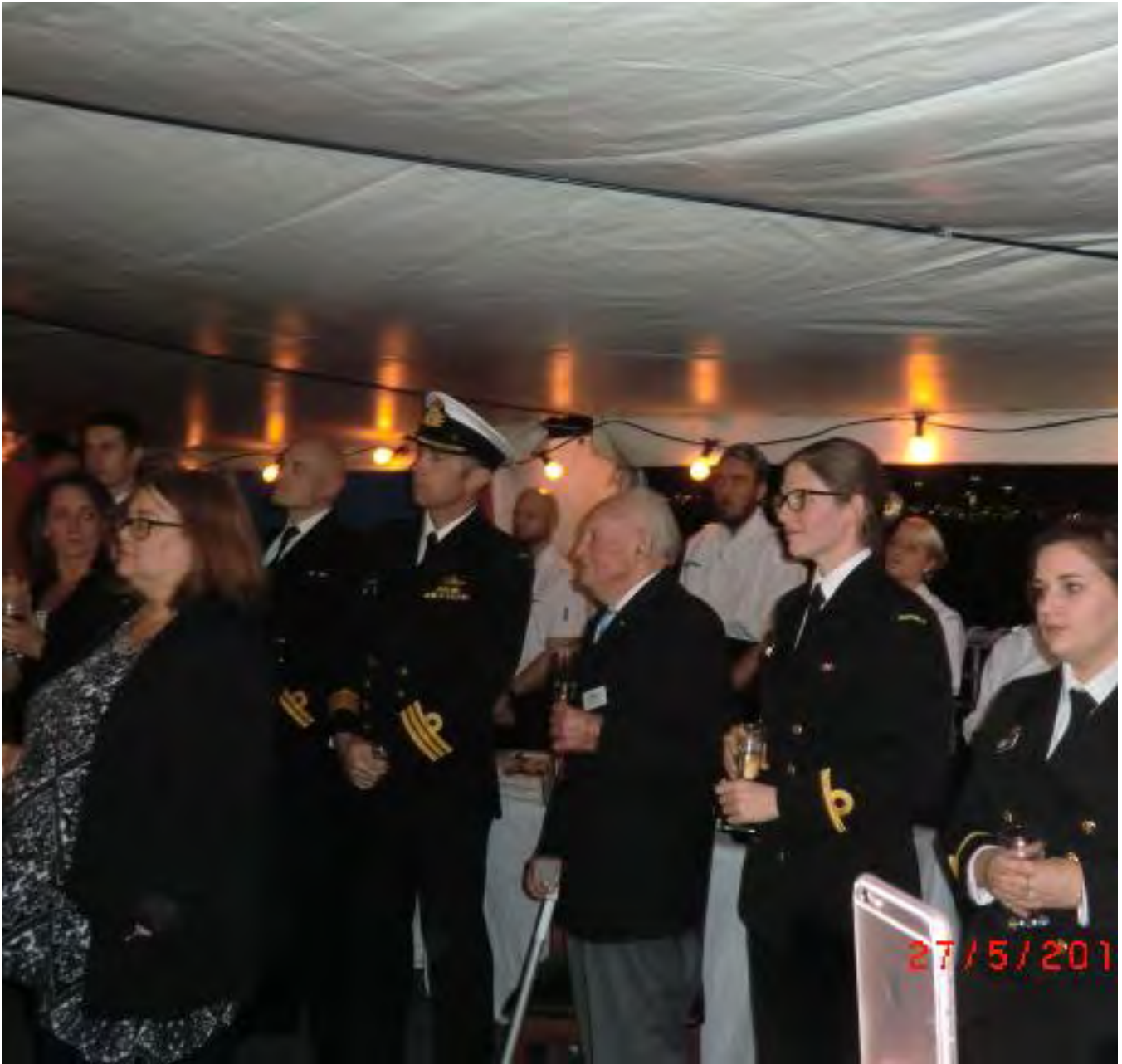
HMAS BALLARAT RECEPTION& CEREMONIALSUNSET