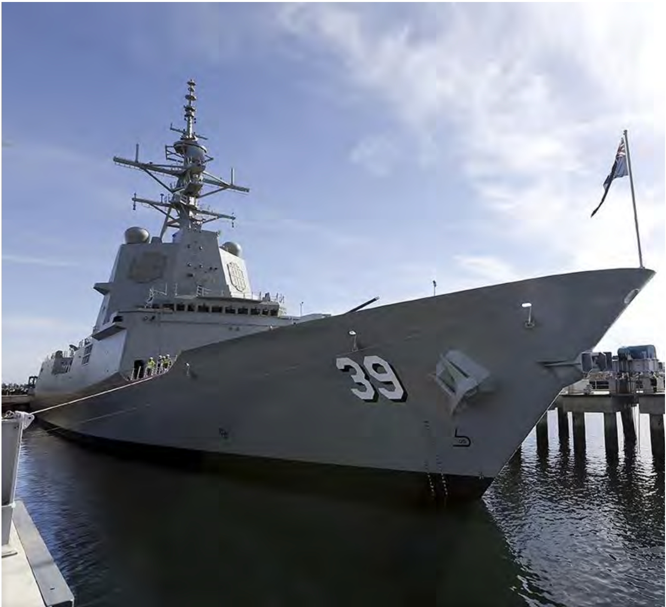
NU SHIP HOBART DDG39