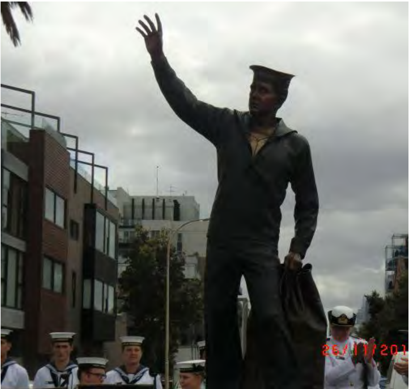
ANSWERING THE CALL