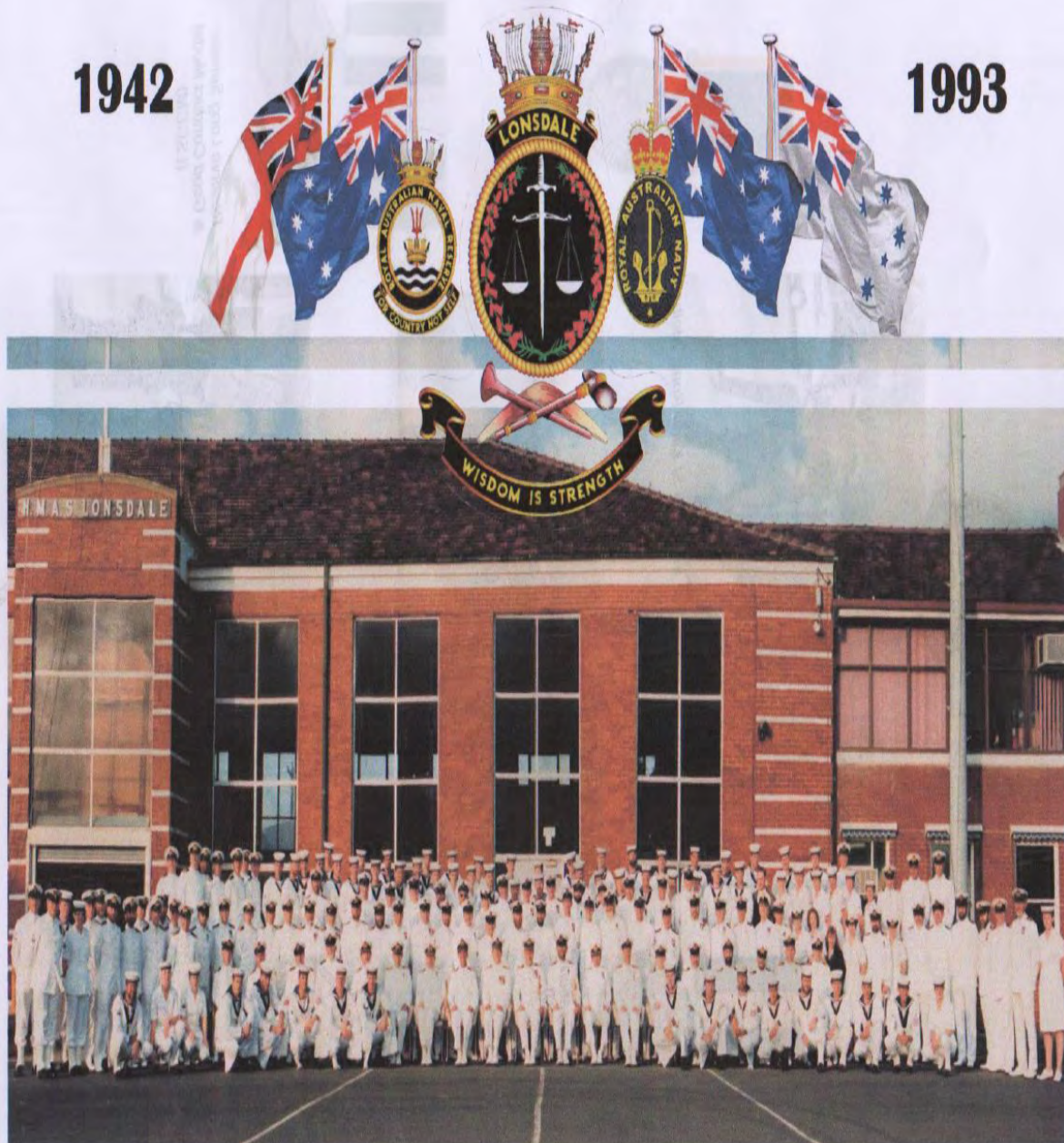
HMAS LONSDALE NO.2. STONE FRIGATE PORT MELBOURNE