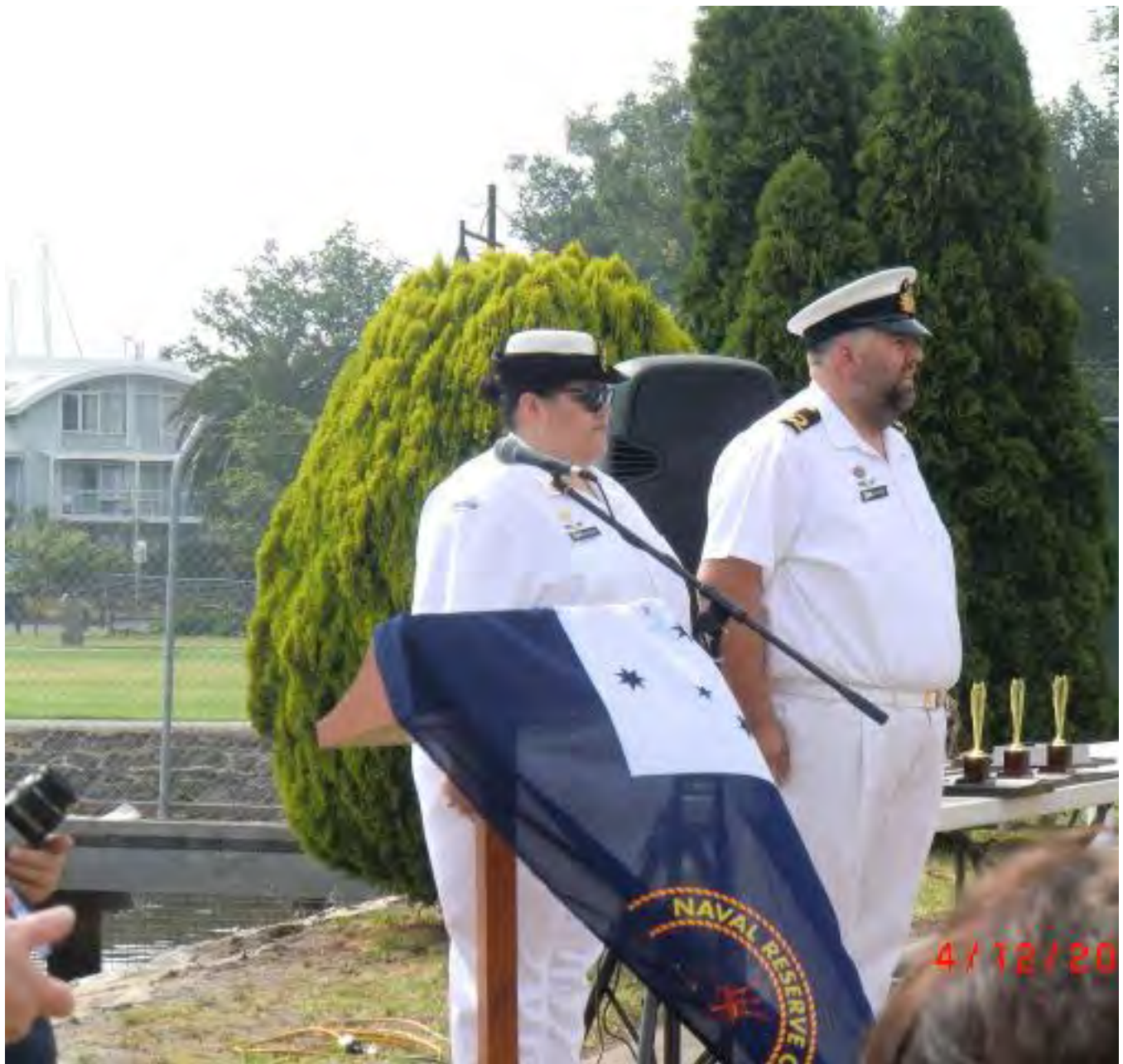
TS VOYAGER AWARDS PRESENTATION