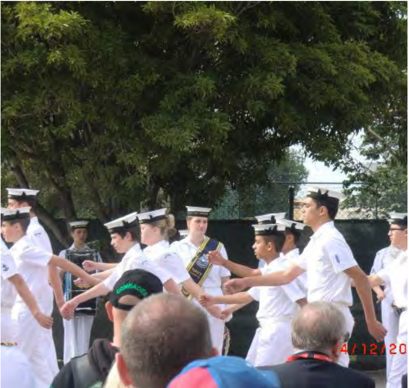
TS VOYAGER CADETS ON PARADE