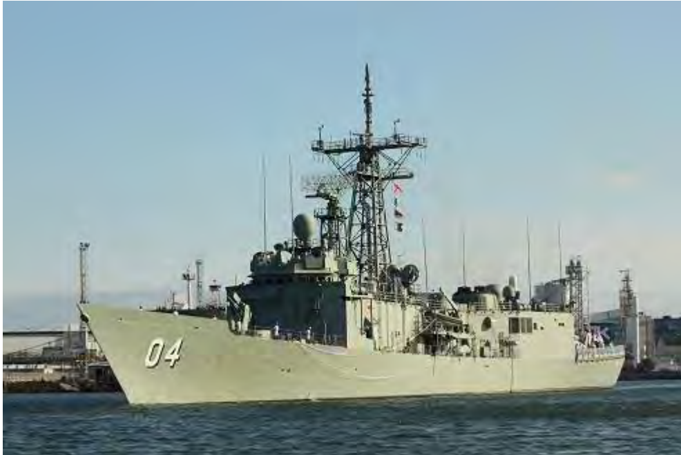
HMAS DARWIN DEPARTING MELBOURNE 1 ST NOVEMBER 2015

H.M.A.S. Darwin FFG04 departs Australia end December 2015 for deployment on Operation Manitou to relieve currently deployed H.M.A.S. Melbourne.