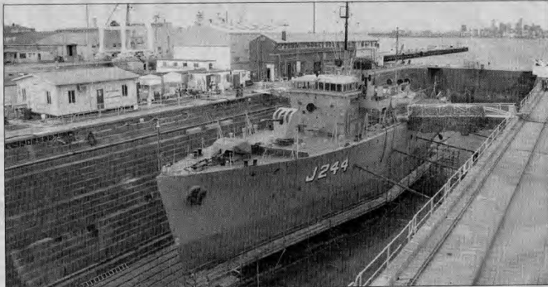
Ship-shape: All clean and ready to go after her beauty treatment.

No plans remain at the foundry because this was war work. Once the engineering job was completed, the plans, and the finished product, were returned to the Navy. But there could be some old-timers out there still who worked at