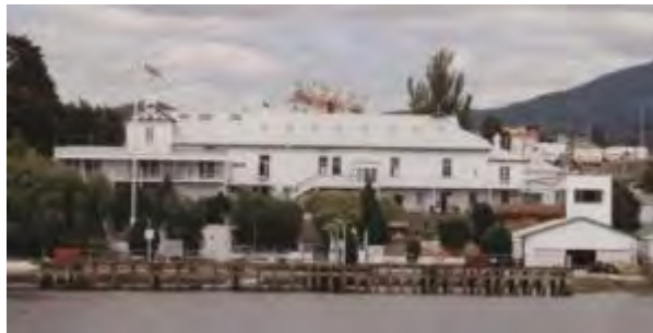
HMAS Huon on the Derwent River, Hobart.