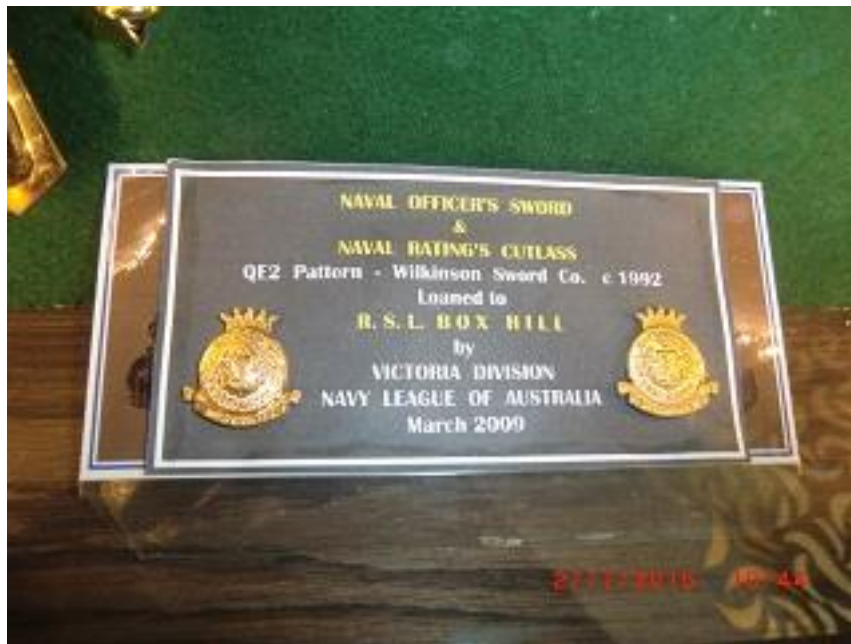
Newly displayed "Sword & Cutlass at Box Hill RSL 2015