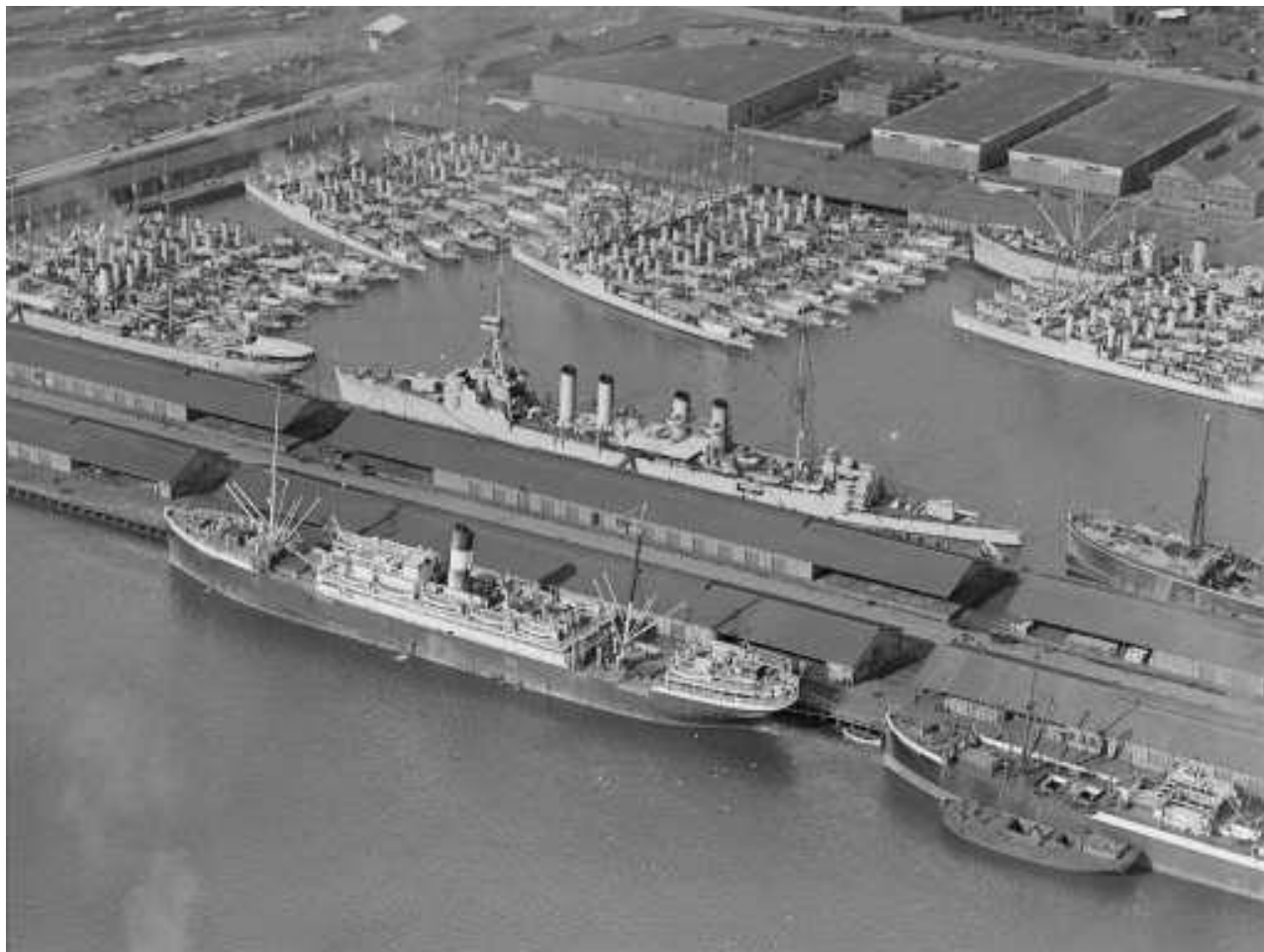
US NAVY VISITORS TO MELBOURNE VICTORIA DOCK 1925