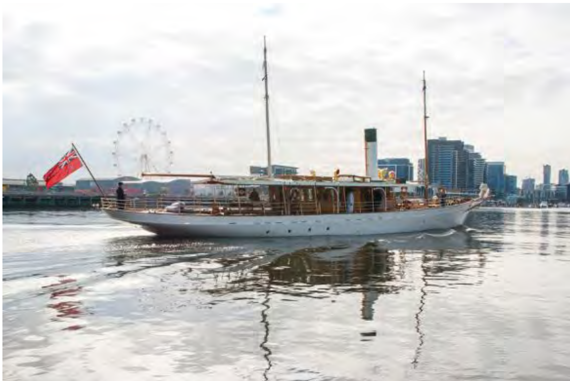
SY ENA GLIDING INTO DOCKLANDS, MELBOURNE