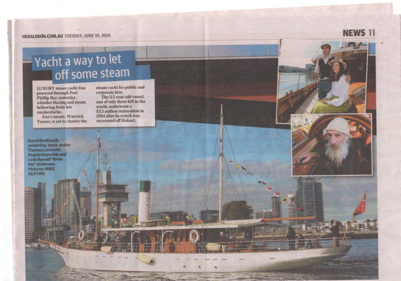
HMAS SLEUTH, NOW NAMED ENA, ON HER ENTRY VOYAGE TO MELBOURNE