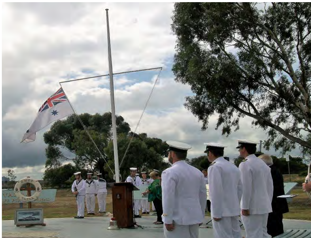
HMAS YARRA (2) COMMEMORATIVE CEREMONY NEWPORT VICTORIA