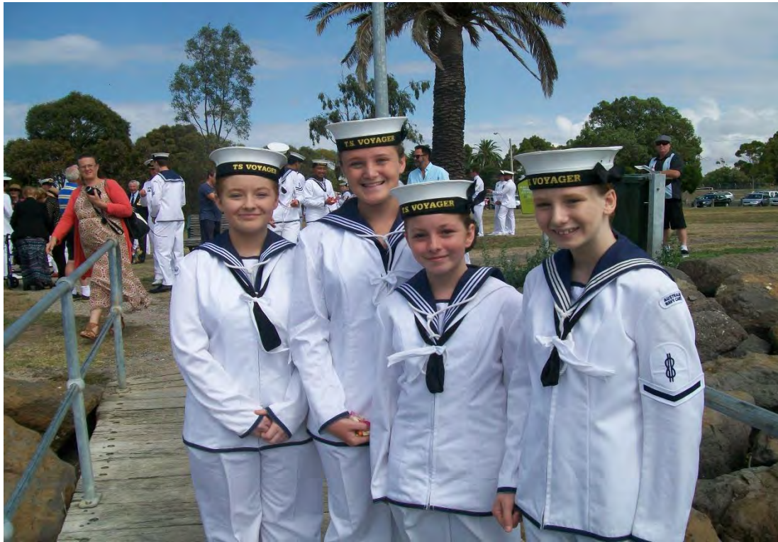
AUSTRALIAN NAVY CADETS FROM TS VOYAGER AT HMAS YARRA (2) COMMEMORATIVE SERVICE 75 YEARS 1942-2017