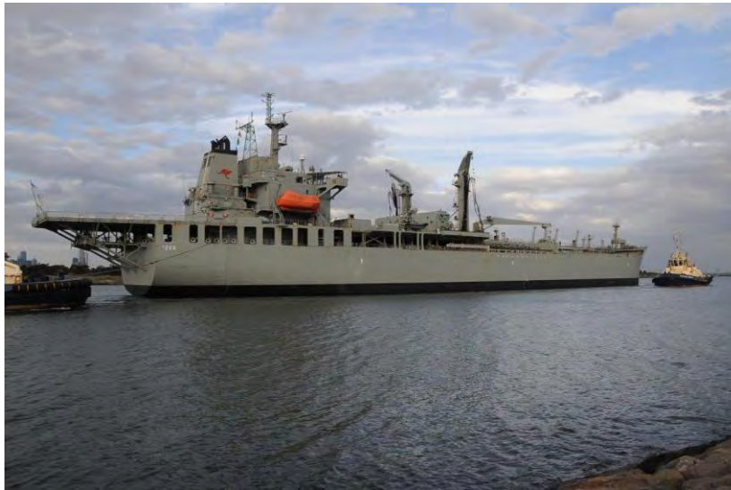
HMAS SIRIUS DEPARTING FROM HER YARRA RIVER BERTH 29 TH MARCH 2017