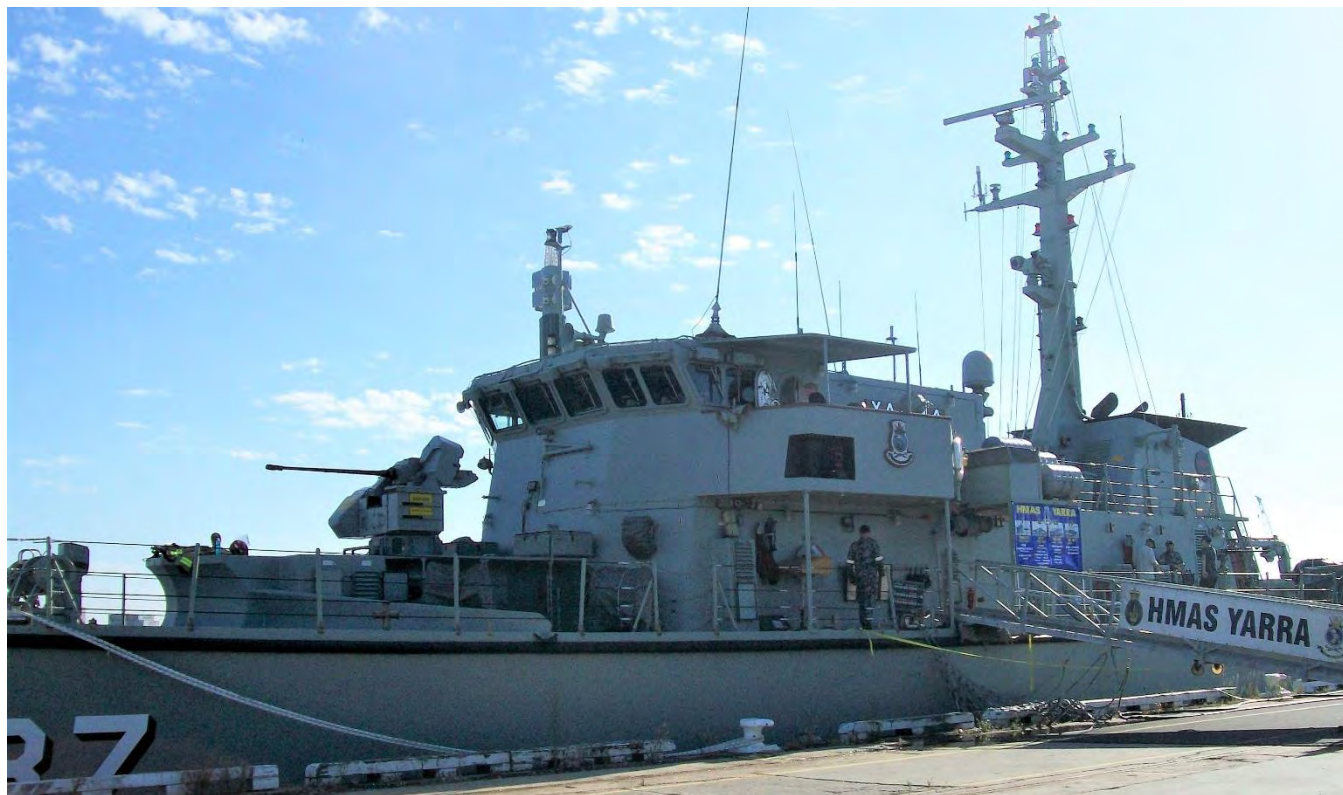
HMAS YARRA VISIT TO MELBOURNE MARCH 2017

It was most illuminating and very special to talk to crew who put their lives at risk to maintain the safety of Australia and its people. We are grateful for the time given by the crew to show us the ship and the most welcome morning tea on the sweep deck.