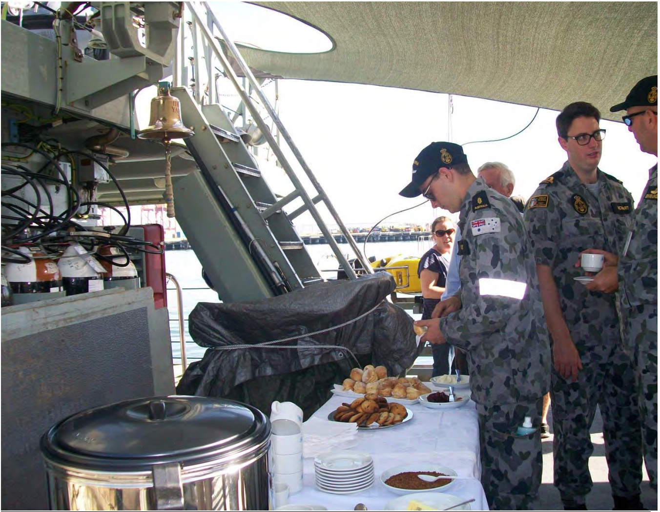
MORNING TEA ON HMAS YARRA'S SWEEP DECK