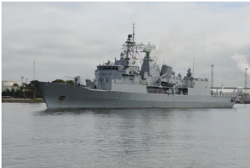
HMNZS TE MANA F111