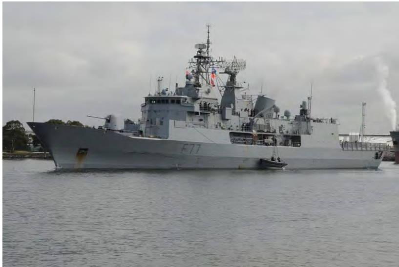
HMNZS TE KAHA F77