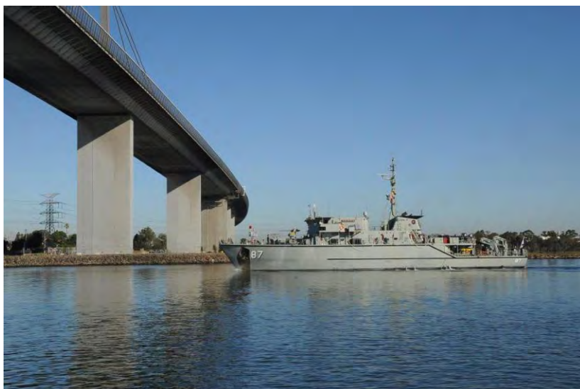
HMAS YARRA M87