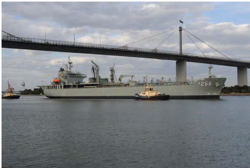
HMAS SIRIUS MELBOURNE VISIT MARCH 2017