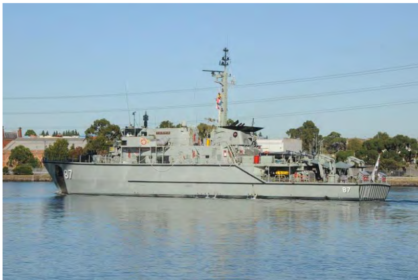
HMAS YARRA M87