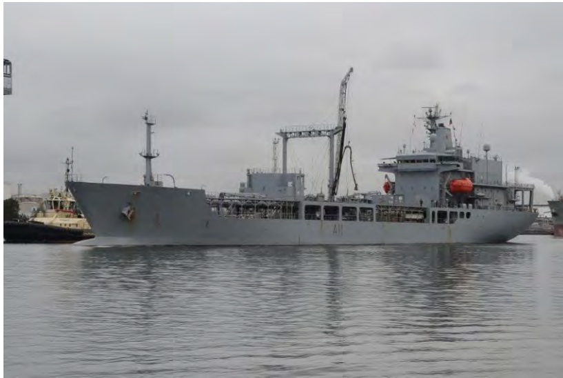
HMNZS ENDEAVOUR A11