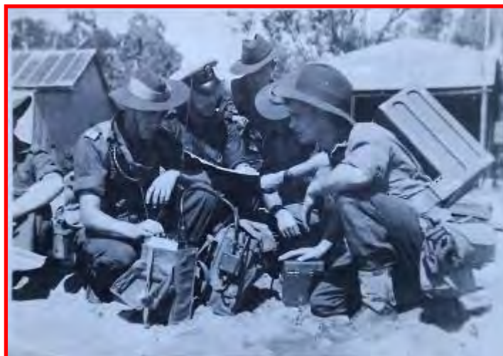
Photo taken at Trinity Beach, Cairns Mock landing with 9th Division AIF showing portable communications equipment.

Front far right: Tel Jack Cleary from Bendigo > NSW > South Africa > Brisbane