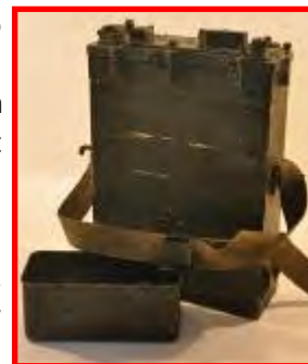
Similar VHF receiver used by the navy in 1944. Would have had short wire aerial and a pair of headphones.

It was many weeks later that when unscrewing the temporary "desk" on the bridge that the offending sheet was found behind it.