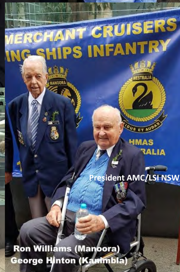
President AMC/LSI NSW