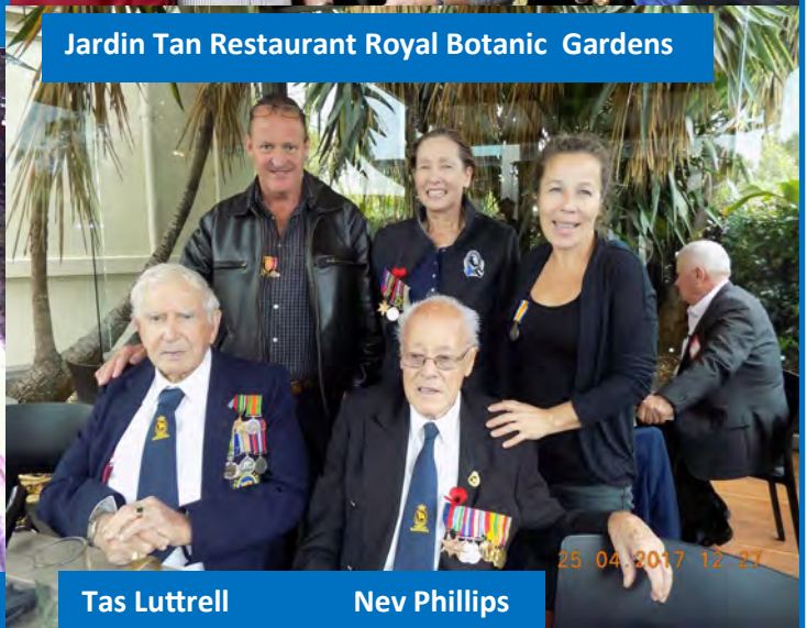
Jardin Tan Restaurant Royal Botanic Gardens